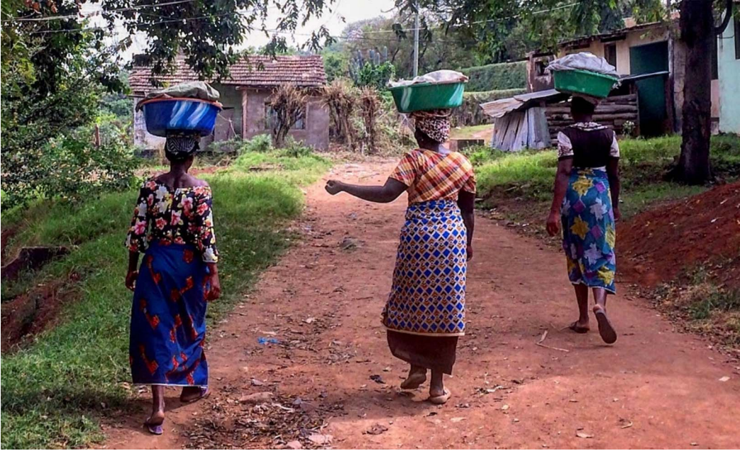
Figure 2. Women walking in the Mwanza region, Tanzania. We estimate that approximately one third of adolescent girls and young women marry under 18 years in the study area, meeting the definition of ‘child marriage’.

population with urbanisation, now matching or even exceeding boys’ education (Hedges et al. 2018). While schooling reduces farm and household work, this is truer for boys; girls who attend school still contribute substantially to domestic chores, effectively taking on a ‘double shift’ of school and domestic work, reducing their time allocation to leisure (Hedges et al. 2018).