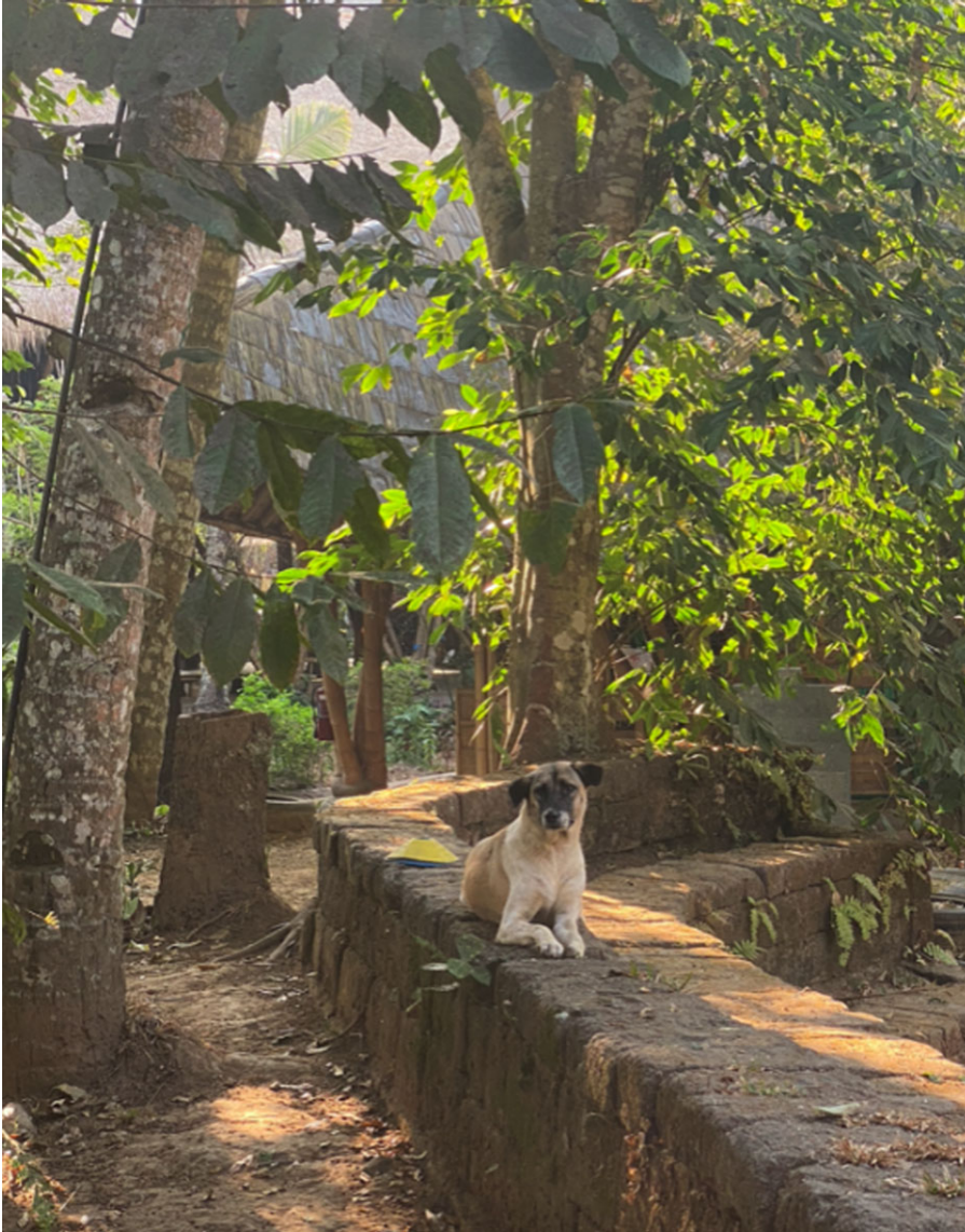
Figure 4. Stray dog from the local area wanders into this wall-less school.

We think it is wild to follow the forces produced with Chalk and Paintbrush in an uninhibited and unrestrained manner, regardless of how traditionally wild the physical environment might appear to be. Instead, we suggest that there is a wildness in this theory-praxis-pedagogy that works with different boundaries, where agential cuts can be enacted at any moment, by anything, even with materials that have been domesticated by humans, like Chalk and Paintbrush. This builds on wild pedagogies. In the section below, we share two material-multispecies moments that inspired our conceptualisation of becoming-wild, outlining how notions of wildness may emerge in novel and surprising ways in everyday classrooms across the world (Figure 5).