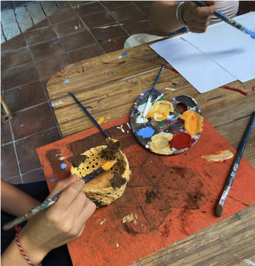
Figure 6. Student uses a variety of paintbrushes to decorate her clay bowl with butterflies.

there is high student-to-teacher ratios and where education is still enacted on the premise of adults as experts and children as receivers of knowledge.