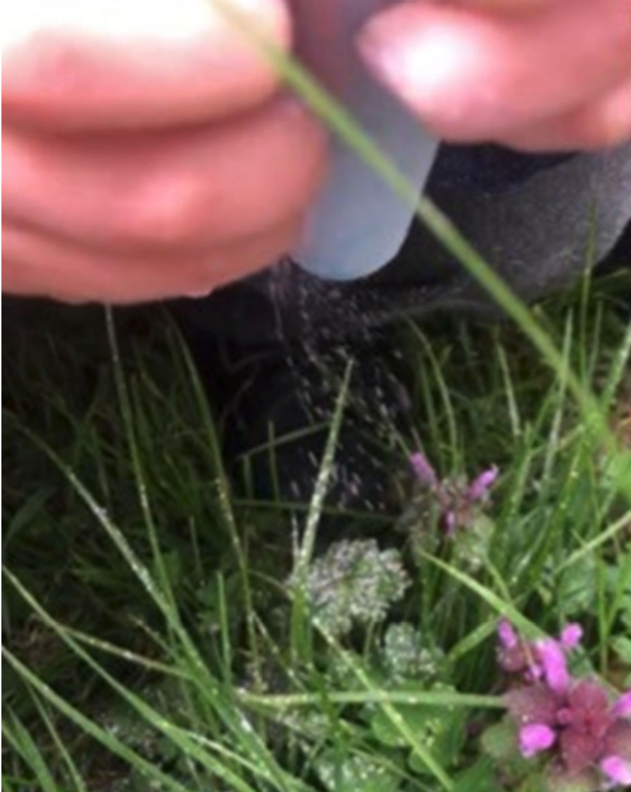
Figure 5. Chalk-grass-Stegosaurus at play.