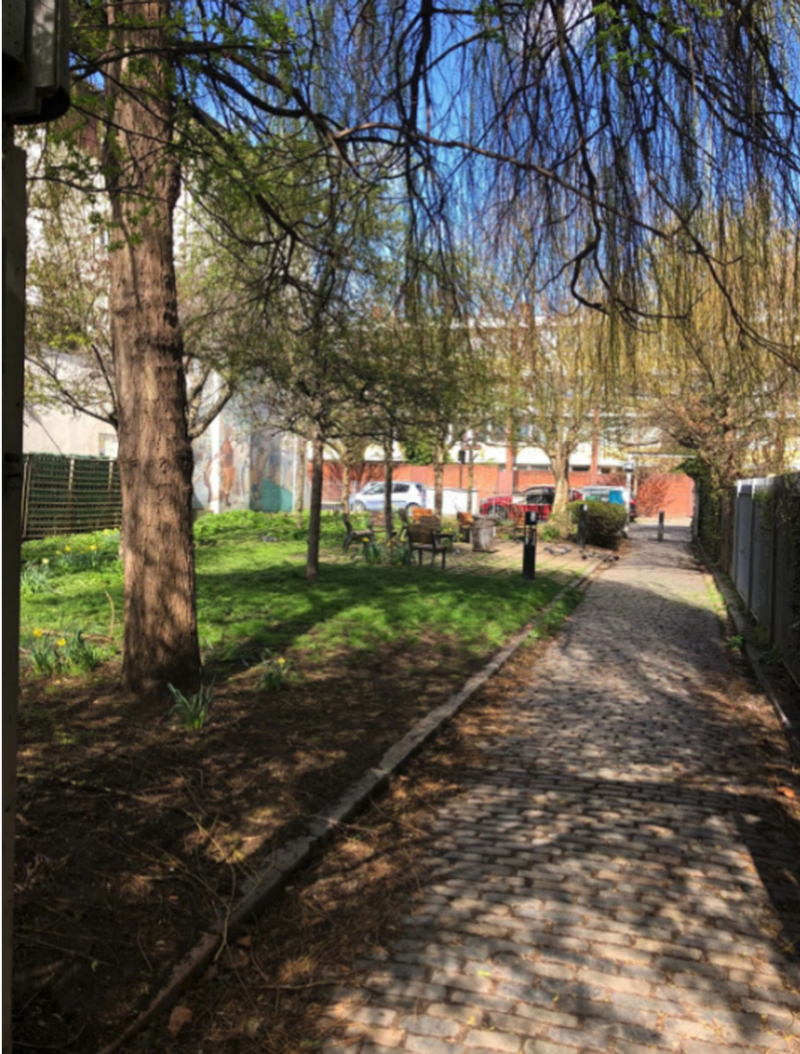
Figure 1. Urban park, the setting for a forest school.

where there are multiple learners co-constituting one another. Learning is not contained by learning outcomes or intentional plans, but practices that become far more random, dynamic and enlivening with/in our shared worlds. This forces us to consider the importance of the everyday, the unseen and often ignored events that come to matter (Figures 3 and 4).