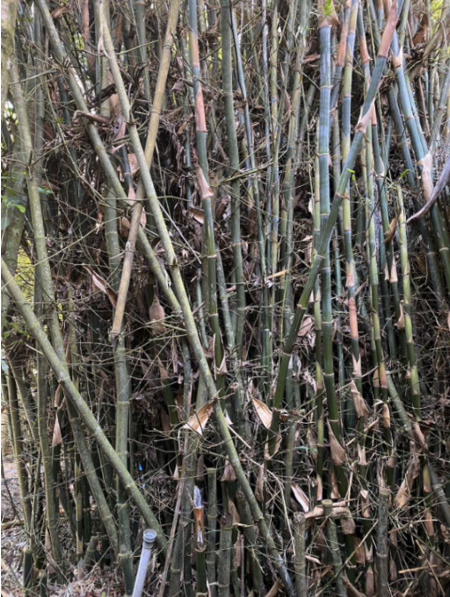
Figure 3. Wild “window” views from a wall-less classroom in a tropical rainforest, Bali.

other species. These are everyday, taken-for-granted moments between and amongst material-multispecies assemblages, which illuminate how asymmetric power relations emerge through intra-actions, thus giving force to anthropocentric attitudes and behaviours. Material-multispecies moments, therefore, attend to tiny and trivial moments that involve both “vibrant materialities” (Bennett, 2010) and multispecies assemblages with human bodies-in-relation. We employed this inquiry approach in our research-pedagogic encounters with Chalk and Paintbrush to help resist human exceptionalism that can be ignited, galvanised and reinforced in typical school learning environments. This illuminated the process of becoming-wild in our very different educational settings.