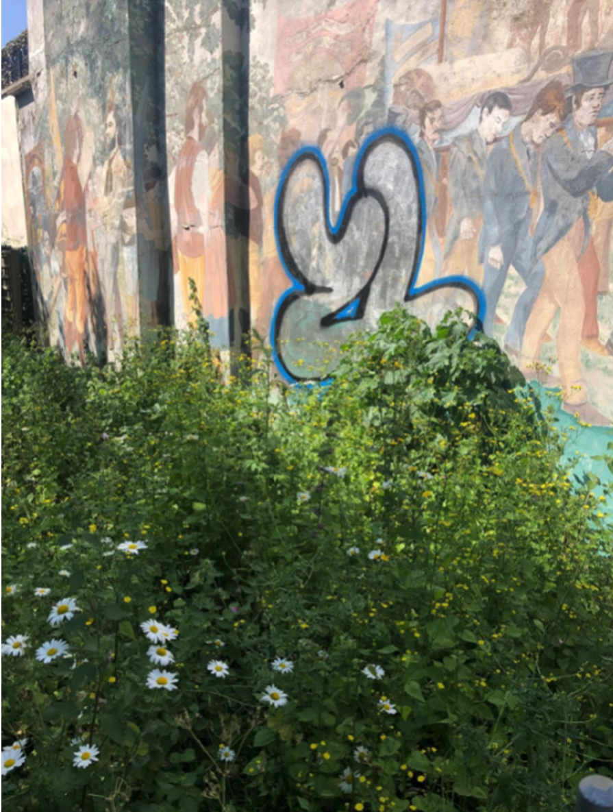
Figure 2. Locating the “wild”: untamed expressions and plants growing in a corner of the forest school site.

anthropocentric forces and instead, open practices for posthumanist “bodies, things and concepts in motion” (Taylor, 2018, p. 20). Material-multispecies moments explore small, immanent moments of relationality between/amongst more-than-human bodies. Taylor’s (2018) material moments are considered as “instances, occurrences and interactions which inhere in, and are enacted through, the materiality of bodily relations” which are “materially dense and specific,” “time-bound and spatially-located” (p. 2). Hankin’s (2022) multispecies moments are inspired by this but focus specifically on the spacetime materiality of relational exchange between humans and