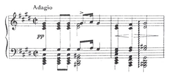
Ex. 1 Franz Schubert, Wandererfantasie, bars 189-91.

Op. 4 No. 1), with variations in the second movement. What resonated through in this self-quotation was the constitutive feature of Beethoven's 'Allegretto', the dactyl motive. Schubert utilized this as a topos, to engender an aura of doom and death, which he made highly dramatic by virtue of a hushed pianissimo and a paralysing stillness, in 'Adagio' tempo (see Ex. 1).