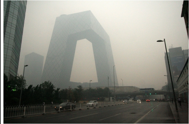
Will Beijing escape from underneath its “smog dome”?

China’s reform and development experience in the past four decades has been far from perfect. Many people remain highly critical of the government’s “growth at all costs” approach during that time and will continue to argue that recent developments are too little too late. However, it could be argued that the Chinese government’s commitments on paper, combined with mounting evidence that positive change is happening on the ground, demonstrate a capacity to drive the greening of the economy to an extent that green supporters in advanced democratic countries (and I have Australia primarily in mind) can only dream about. It may be a long shot, but as of October 2016 I’d still place my money on the Chinese government to play a positive role in “lifting the dome” in the decade ahead, both domestically and internationally as well. Given an increasingly environmentally aware public, whose demand for greener living will only increase with time, the preservation of Party power is at stake: and that’s the best incentive of all.