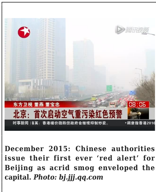
December 2015: Chinese authorities issue their first ever ‘red alert’ for Beijing as acrid smog enveloped the capital.

government, including its threat of “iron-handed punishment” for environmental lawbreakers, signals a sincere interest in tackling China’s environmental problems. Yet without a more systemic program of environmental management within China, similarly strong commitments by all the nations of the world and substantial personal efforts on the part of the world’s 7.3 billion individuals (especially the billion or so richest ones) it is hard to imagine how we will ever escape from “under the dome”.