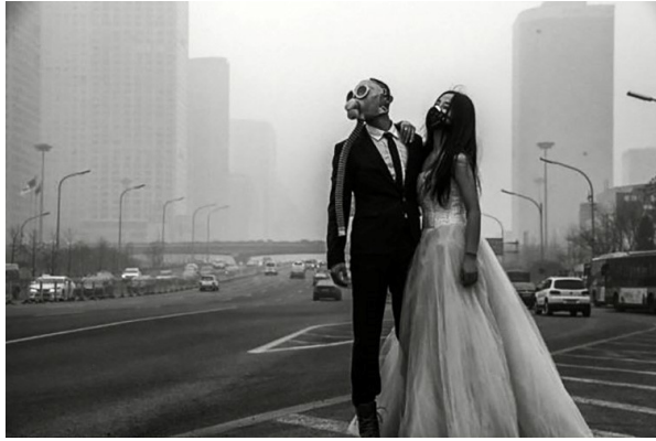
According to Under the Dome, Beijing's daily PM2.5 level is five times that of China's average.