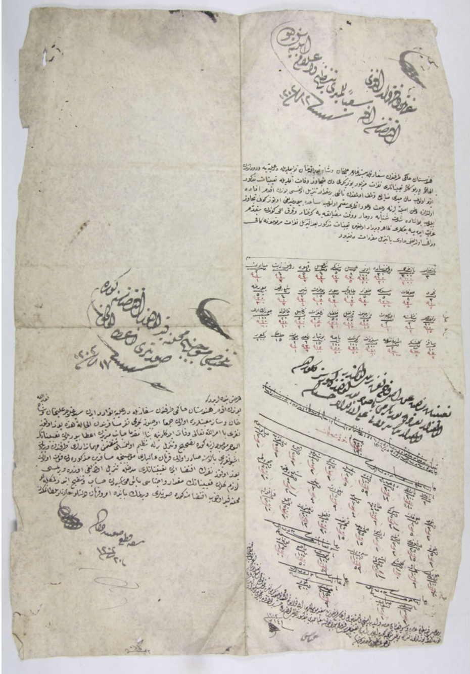
Figure 1 An Ottoman inventory of foods that were provisioned to the Mysore embassy. The document also mentions multiple deaths among the visiting envoys. Source: OA, C.HR. 82/4063, courtesy of Osmanlı Arşivi.

Matters began to improve with the spring thaw, which also brought a flurry of further activity at the imperial chancery. The Porte decided that the Indians could now benefit from a change of scenery and accommodation, because “from want of harmony to this