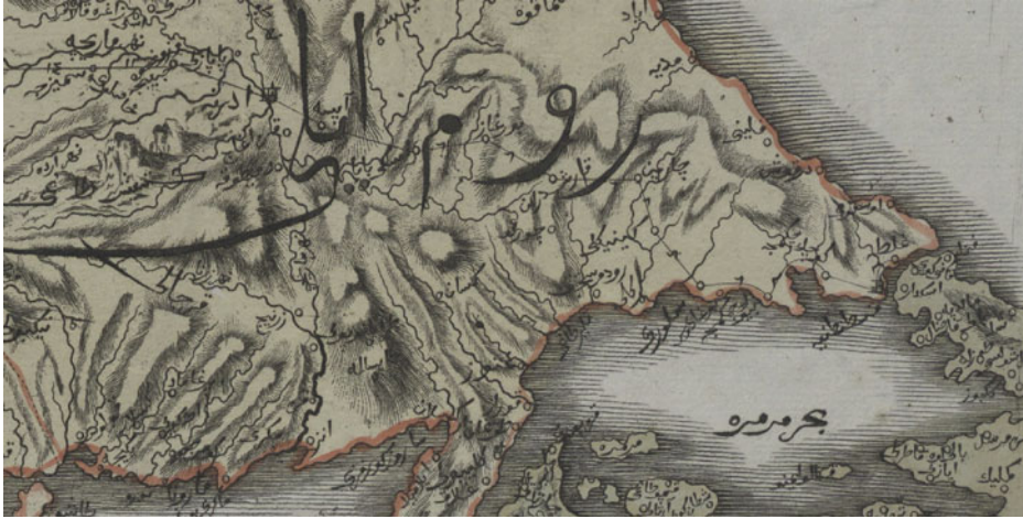
Figure 2 Detail from an 1801 Ottoman map, showing Istanbul (Kostantiniye) and the European (Rumeli) regions of the empire. The Mysore embassy's sojourn in the Turkish capital was marked by some ups and downs.

research regarding which may force us to qualify a historiography that has tended to represent Islamicate diplomatic ventures as exclusively “ad hoc” undertakings. 51 This collection is moreover truly bilateral in scope. No other example of an Islamicate embassy from before the Mysore-Ottoman exchange offers such depth and breadth of empirical evidence from both sides of an interstate exchange.