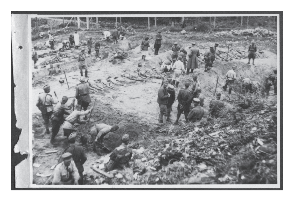
Figure 3. Excavations of victims from Janowska camp, c. September 9-October 20, 1944. Photograph taken by Soviet criminology expert Nikolai Ivanovich Gerasimov. GARF, f. R-7021, op. 116, d. 83, l. 138.