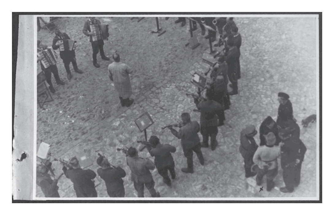
Figure 4. Photograph obtained from Herman Lewinter and published in the ChGK's communiqué on Lviv oblast, December 23, 1944. GARF, f. R-7021, op. 116, d. 83, l. 144.