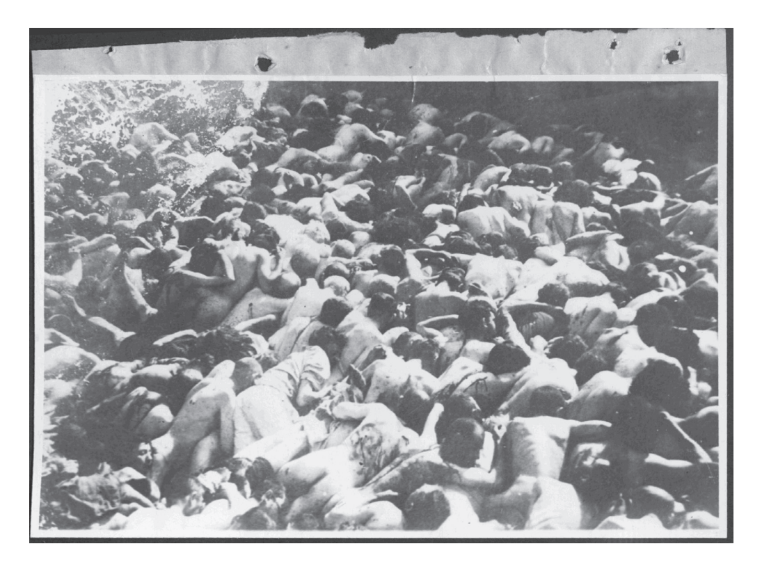
Figure 5. Photograph of victims from Zolochiv that appeared adjacent to the orchestra picture in the ChGK's communiqué, December 23, 1944. GARF, f. R-7021, op. 116, d. 83, l. 145.