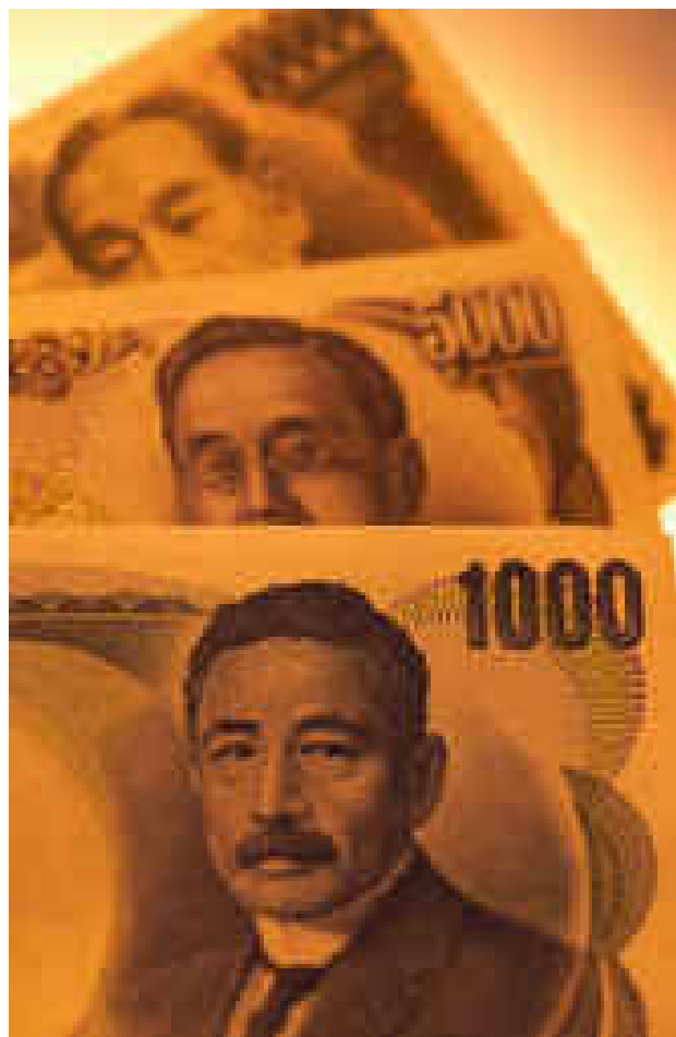
The value of the Yen spiraled following the Plaza Accord

As Japan's high-quality exports kept rising, Ezra Vogel (Harvard's leading expert on Japan) published a new edition (1985) of his seemingly prescient bestseller (it first appeared in 1979), Japan as Number One . Japan's expansive trend actually defied the revaluation of yen and accelerated during the next four years: the Nikkei index stood at just over 13,000 by the end of 1985 and it peaked at nearly 39,000 in December 1989. But right afterwards Japan's bubble economy burst in spectacular fashion (Wood 1992; Baumgartner 1995). History has no other example of a country whose standing switched so rapidly from that of a globally admired technical and manufacturing superpower to that of a deeply ailing, has-been economy.