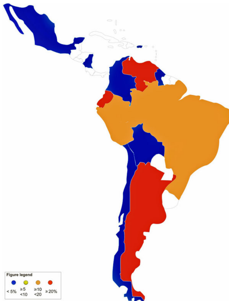
Fig. 2. Prevalence of strongyloidiasis in Latin America according to population-based and school-based surveys. Colours are representative of the highest level of prevalence found in the country.

infected subjects was very low, exceeding 2% in only one study in Puerto Rico [92].