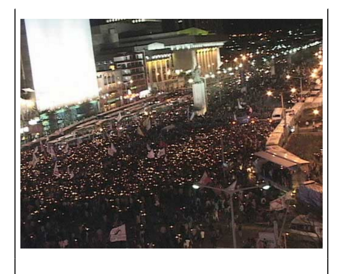
Candlelight vigil on December 7, 2002 surrounds US Embassy in Seoul

Amids USFK transformation and base realignment and consolidation in South Korea, local residents and activists once again joined forces to oppose the expansion of Camp Humphreys in Pyeongtaek. Figure 1 below indicates which bases were slated for closure and consolidation, emphasizing the closure of bases in and around Seoul and the opening of new bases in the far south.