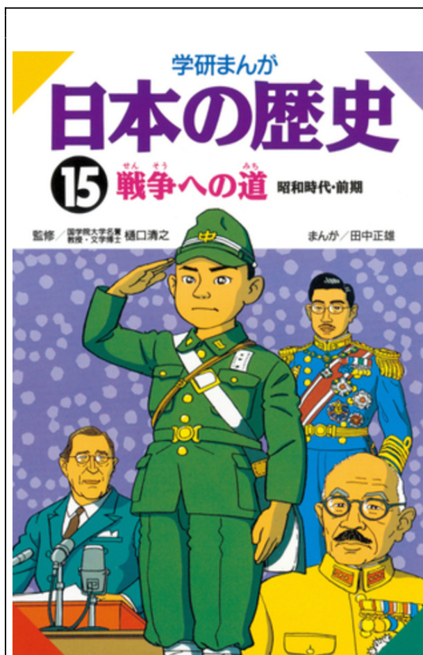
The Road to War (Gakken's manga history of Japan)

readers. Other than the outlines of events, there is no close reasoning of the causal chain of events. They are tuned to cognitive rather than conceptual comprehension, and emotional rather than rational understanding. These, abridged history stories for young children are sanitized cultural products, but they can nevertheless play a notable role in cultivating moral and even political dispositions. What is inculcated here is a simple pacifist sentiment that precludes any possibility of a just war: war is bad and unjust, because war kills and people suffer; it is an evil that hurts people like you, your family and friends; the government that wages war is bad, and can’t be trusted to help and protect you.