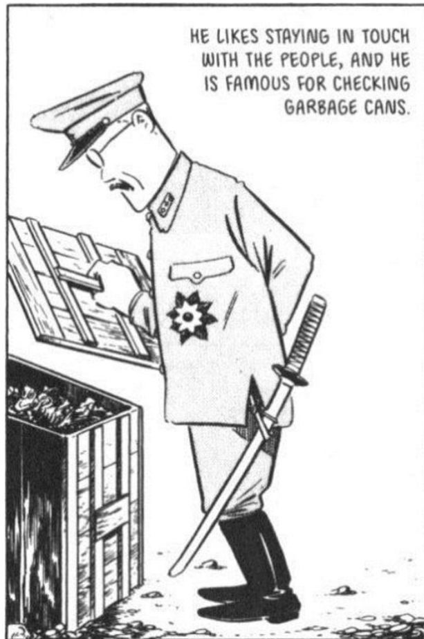
The Tripartite Pact (Mizuki Shigeru's manga history of Shōwa Japan) Prime Minister Tojo inspecting the garbage (Mizuki Shigeru's manga history of Shōwa Japan)

Mizuki's war history, focused on the lowest rung of military life, is an especially gripping tale that young readers can probably empathize with. The young men in the stories who went to war and died for the country, however, are not heroic personalities that children could desire to emulate. They are unfortunate scrawny characters, beaten and broken, who succumbed to defeat. To be sure, there are extensive battle scenes, and gallant military encounters especially in the first six months of the Pacific War – like Pearl Harbor – reminiscent of boys' war stories popularized in major comic weeklies in the 1960s. 25 But as losses mount and war prospects turn grim, the battles