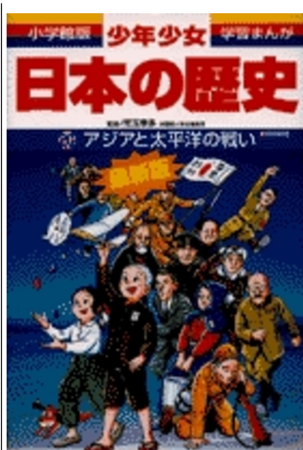
The War in Asia and the Pacific (Shōgakukan's manga history of Japan)

For the most part, the academic manga offer colorful portrayals of 2000 years of Japanese history from early settlement through the contemporary era in chronological order. The portrayal of the Asia-Pacific War usually takes up one volume, averaging about 150 pages in length. As a portrayal of a discredited and disastrous war, there are no gallant national heroes or enchanting political leaders that brighten up the pages and dramatically drive the plot. Instead, the stories unfold with accounts of divisive politics and deteriorating economic life that are rife with social conflict, unstable government, ambitious military, terrorist violence, rogue actions, and rampant poverty. These accounts are interspersed with descriptions of bloody violence, oppression, and massacres, which, in turn, lead ultimately to crushing defeats, mass deaths, and the devastating national fall.