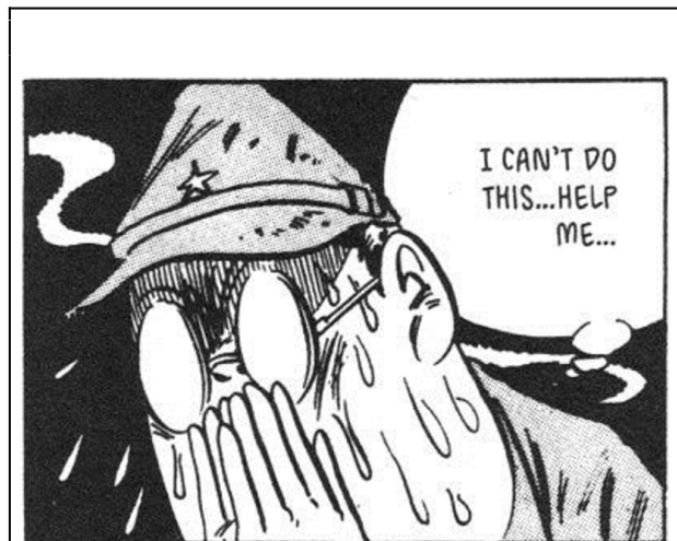
Soldier Mizuki in mortal fear on the battlefield in Papua New Guinea (Mizuki Shigeru's manga history of Shōwa Japan)

become more chilling than thrilling and the soldiers become more pitiful than brave. For hundreds of pages, readers wading through graphic illustrations of men falling and dying – in Leyte, Guadalcanal, Imphal and elsewhere – can recognize the protracted despair. There is no exhilarating valor. 26