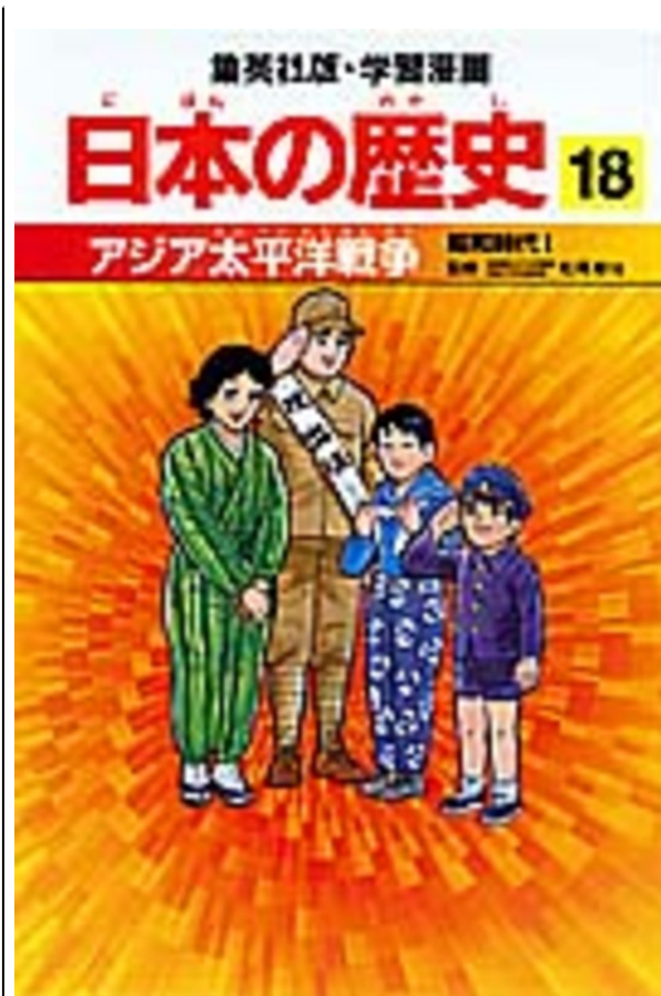
The Asia-Pacific War (Shūeisha's manga history of Japan)

No heroes make their mark in these academic study manga, but a few villains make unceremonious appearances. None of these villains are American, Chinese, Russian, or anyone else in the enemy camp; they are all Japanese. The designated “bad” characters are Japanese men who advocated, instigated, promoted, and then bungled the war. Such “war mongers” are usually officers of the Japanese Army, especially those in the Kwantung garrison in Manchuria and the high military and state leadership who backed and covered for the rogue Army. These loaded characterizations produce a vernacular understanding of Japan's colonial war on the continent in young readers who develop an early moral awareness of “something gone terribly wrong in Japanese history.”