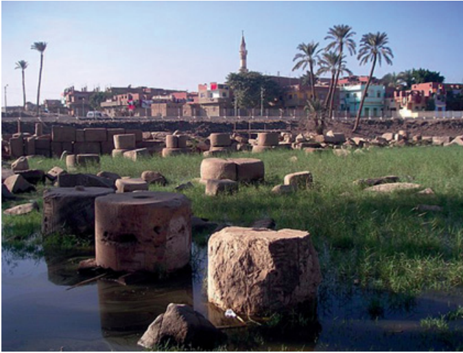
Figure 4 Ruins of the Hypostyle Hall and Pylon of Ramses II in Mit-Rahineh, Memphis.