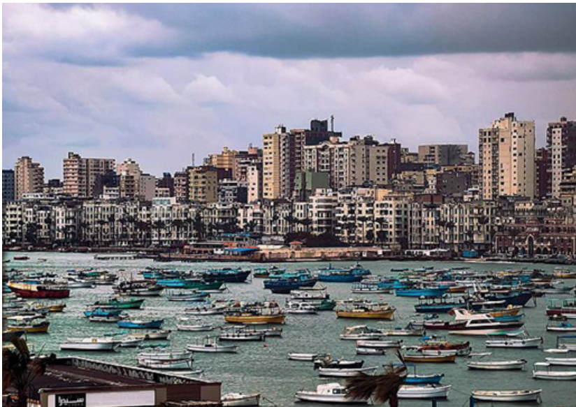
Figure 7 Contemporary Alexandria.