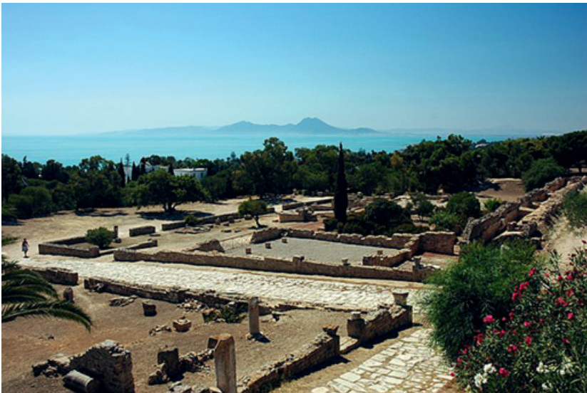
Figure 6 Bird's eye view of ancient Carthage.

The Antique City of Carthage. This city originated as a Canaanite Phoenician colony on the east of Lake Tunis in present-day Tunisia. It is said to have been founded by the Phoenicians of Tyre in 814 BCE and was named Carthage, which simply means “new town” in Phoenician. From its seemingly routine beginning, the city evolved to become one of the largest, most famous, and wealthiest cities of the classical world (see Figure 6 ). It derived this reputation and fame from its role mainly as a thriving port city and trading hub of the Ancient Mediterranean region. That Carthage rose to play an important role as a hub of international trade did not happen by chance. Rather, as Patrick Hunt (2017) noted, the Phoenicians exercised much care in selecting sites, especially for their maritime colonies. They prioritized the quality of harbors and their proximity to trade routes. The decision to locate Carthage on a promontory on the coast was intended to afford it influence and control over ships passing between Sicily and the North African coast as they traversed the Mediterranean Sea.