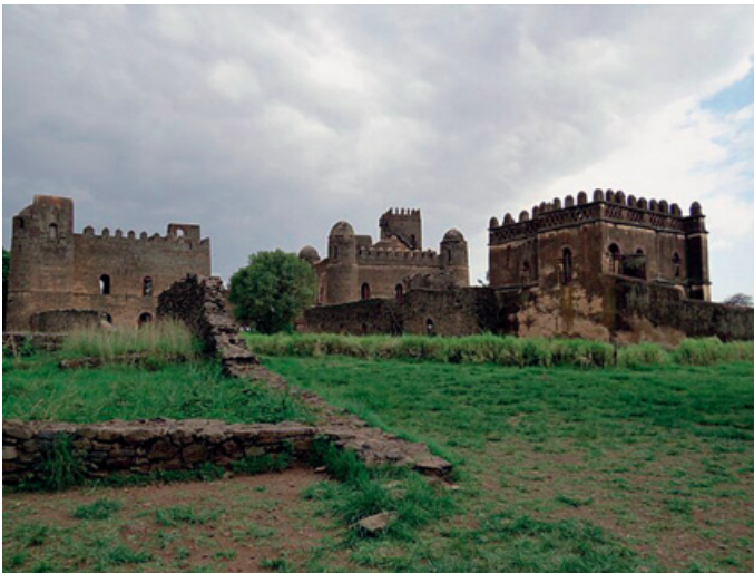
Figure 2 Malindi Town, Kenya today.

In North Africa, we find Fèz, which was founded in 786 CE in present-day Morocco, and Cairo, founded in 641 CE in present-day Egypt. As a testament to their global reach, some of these cities, such as Lagos and Porto Novo were major slave ports during the infamous Trans-Atlantic slave trade. Lagos, currently one of Africa's few megacities, evolved to become Nigeria's national capital during the first three decades of the country's postcolonial era (1961–1991). Porto Novo – locally known as Hogbonu or Ajashe – originated as