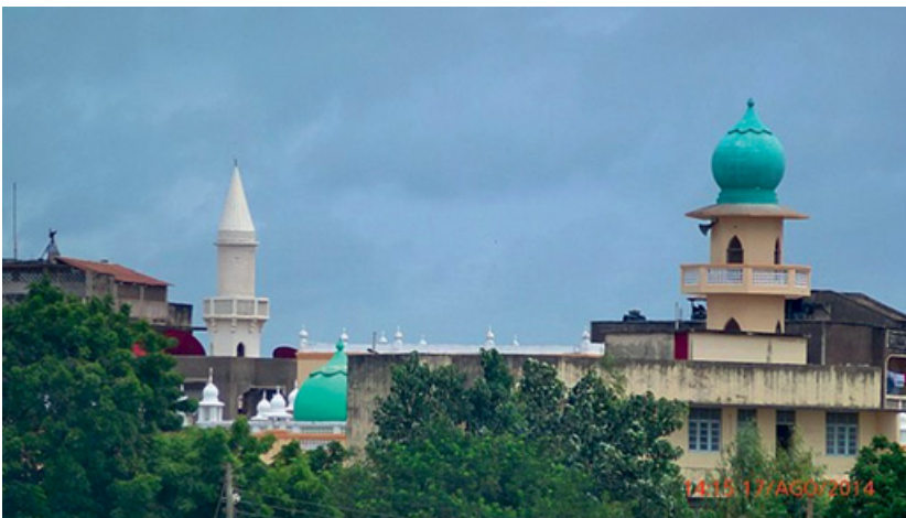
Figure 1 The Fasil Ghebbi Castle, Gondar, Ethiopia.

Ancient Cities. Prominent among ancient African cities that were established during the Common Era are, Axum, Timbuktu, Great Zimbabwe, and Cairo. Major ancient cities in Ethiopia such as Gondar, home of the famous Ghebbi Castle (Figure 1), and Axum (or Aksum), which rose to become a major trading hub and a key player in the ancient trade among Africa, Arabia, and the Roman Empire, was established in Ethiopia in the 1st century CE. Timbuktu, which