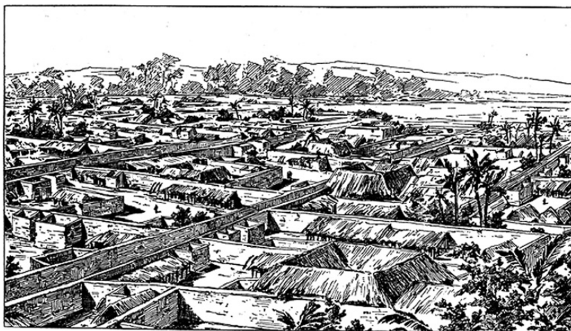
Figure 8 Drawing of Benin City prior to its destruction by the British in 1897.

The Ancient Kingdom of Benin, Nigeria. A major gap in the history of urbanization in Africa is the scant attention that it has afforded Benin City. Yet, as shown in Figure 8 , the history of this city is as rich as that of any other ancient human settlement in Africa. Like most ancient cities on the continent, Benin served as the seat of government for a great kingdom, the Kingdom of Benin. This was established in the 11th century and flourished as a well-organized, sophisticated, and powerful kingdom whose dominion extended to many parts of present-day southern Nigeria. Also, like many ancient cities, Benin City actively participated in trade, commerce, and societal governance. Concerning trade, it was reputed as a center of trade for brass and ivory products, all products that were considered hot commodities, especially by European traders. The kingdom attained its pinnacle during the reign of King (or Oba) Ewuare the Great (1440–1473); he significantly extended the kingdom’s dominion to cover many parts of contemporary south and southeastern Nigeria.