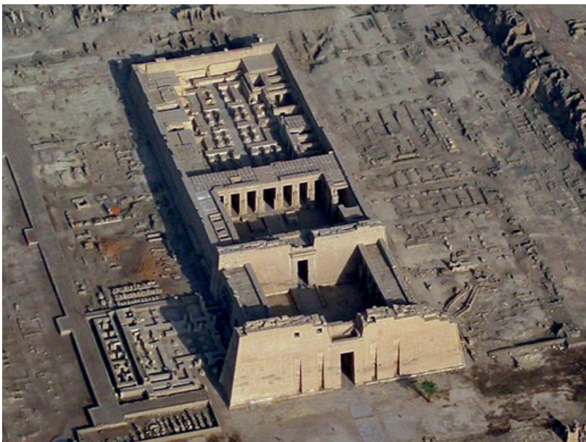
Figure 5 Thebes Necropolis.

The Antique City of Amarna. This city was originally named Akhenaten when it was established in 1346 BCE; Amarna is its modern Arabic name. Located between the ancient Egyptian capitals of Memphis and Thebes, Amarna was one of the cities that served as the seat of the Egyptian government in ancient times. It was the capital under Pharaoh Akhenaten (1353–1336 BCE), a powerful Egyptian king with an unbridled propensity for self-absorbance. This propensity was evident in the fact that he ordered the creation of a new capital city, Akhenaten, which he named after himself and in honor of the sun god, Aten.