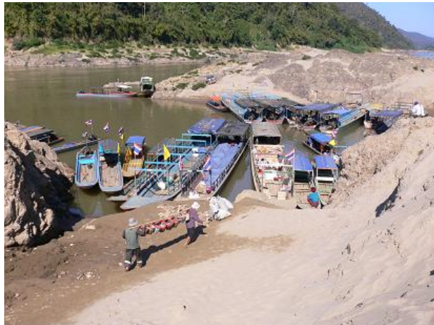
Photograph 1: Salween at Ban Sam Laep

(See Photograph 1 of the Salween taken at Ban Sam Laep, on the left [Thai] bank, where the river forms the boundary between Thailand and Burma.)