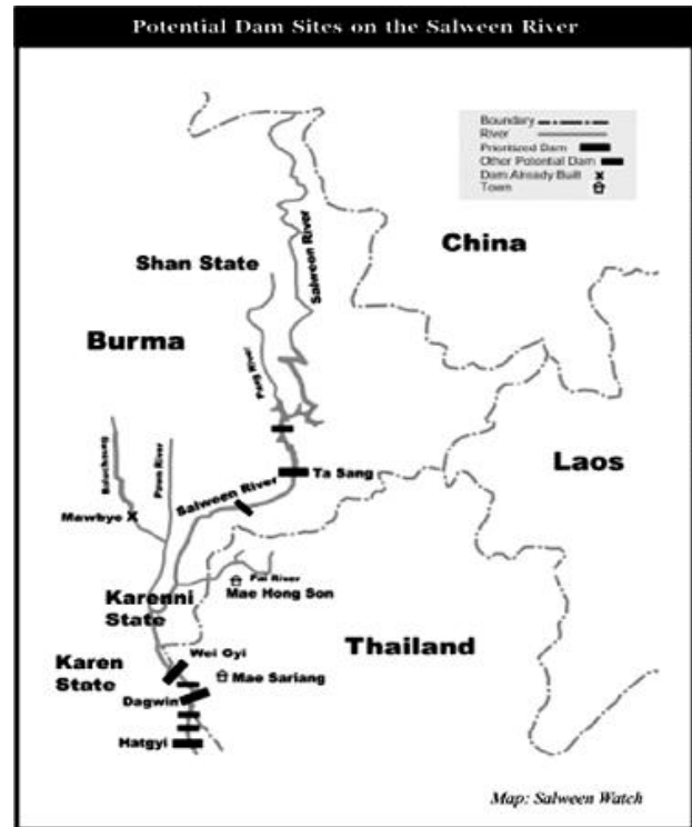
Map 2: Potential dam sites of the Salween River

Of great importance to any discussion of the Salween's future as a prospective site for a series of dams is the rich biodiversity existing along its entire course. In addition there is a remarkably diverse set of minority ethnic population groups in the regions through which it flows, both in China and Burma. Indeed, the presence of ethnic minorities along the Salween in Burma has been the touchstone for the vigorous opposition to the plans for the construction of dams on the river from a varied range of advocacy NGOs, most particularly in Thailand. Both in Burma and in China there is concern among human rights advocates that dam building will lead to the displacement of populations. And this prospect, as discussed later, is seen by critics of the Burmese regime as yet another example of that government's efforts to impose control over dissident minorities.