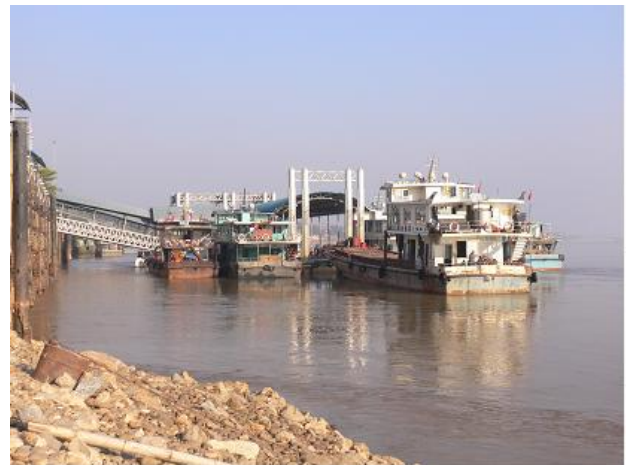
Photograph 2: Chinese vessels at Chiang Saen

there are plans to build a further facility downstream from Chiang Saen, which will be capable of servicing vessels up to 500 DWT. Although some of my informants spoke of work already being under way for this new port, with feasibility studies supposed to have been completed by 2006, I did not see any indication of this during my visit to Chiang Saen. (See Photograph 2 of Chinese vessels moored at the existing Chiang Saen facilities in January 2007.)