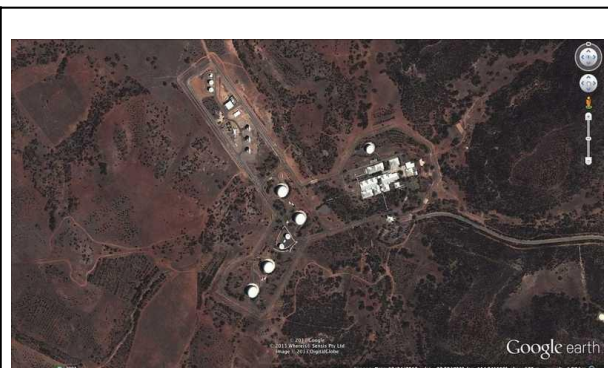
Australian Defence Satellite Communications Ground Station, Kojarena. Google Earth, December 2012. MUOS and WGS ground terminals are located in the upper left arm of the facility

The Australian Defence Satellite Communications Ground Station (ADSCGS) at Kojarena, 30 km east of Geraldton, is operated by Australia’s most important intelligence agency, the Australian Signals Directorate (ASD). Kojarena station is a powerful and large signals interception facility, part of a worldwide system of satellite communications monitoring organised under the most important defence agreement Australia has, the UKUSA Agreement between the US, Britain, Canada, New Zealand and Australia.