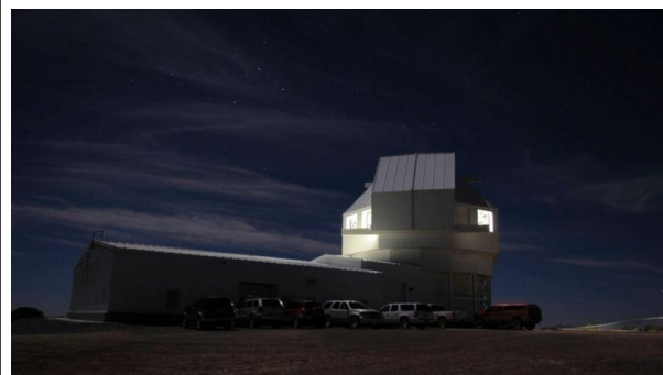
Space Surveillance Telescope, Socorro, NM; before transfer to WA site

The SST will be particularly important for tracking satellites and space debris in geo-synchronous orbits, including micro-satellites. There are now a large number of Chinese military intelligence, communications, and global positioning satellites in geo-synchronous earth orbits (GEO). Blinding China’s space and air surveillance assets is a fundamental US task if US Navy carriers task groups are to operate in the East and South China Seas close to the Chinese coast. The Pentagon said ‘the Australians are in the process of selecting a site for the SST’, possibly at either North West Cape or Kojarena. 27