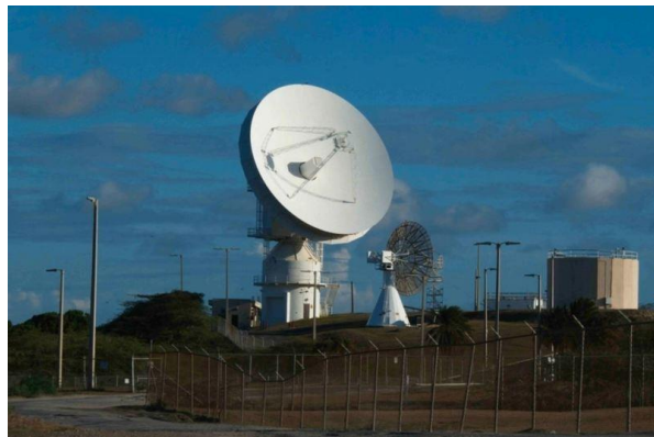
C-band radar in Antigua, before transfer to North West Cape

The space radar is soon to be joined to a new space telescope. Space Surveillance Network radars can detect objects in geo-synchronous orbits (GEO) around 36,000 kms altitude to some extent, but searching in GEO is “time-consuming and difficult”, while telescopes can do so much more readily. 23 At AUSMIN 2012 the two countries decided to deploy a highly advanced Space Surveillance Telescope (SST) built Defense Advanced Research Projects Agency (DARPA) from New Mexico to Australia. 24