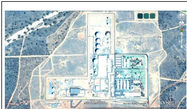
Pine Gap, January 2013

Pine Gap's main role concerns signals intelligence. It is a control, command and downlink ground station for satellites in orbits 36,000 kms above the earth collecting intelligence from all manner of electronic transmissions (signals intelligence) including missile telemetry, radars, microwave transmissions, cell phone transmissions, and satellite uplinks. As well as retaining its long-running strategic intelligence roles, the expansion and upgrading of Pine Gap has brought the facility into the heart of US wars in Iraq and Afghanistan. And now, of course into current military and CIA counter-terrorism operations, including the US of drones for assassination, in Pakistan, the Yemen, and Somalia.