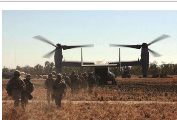
US Marines and Osprey, exercise Koolendong, Bradshaw Field Training Range, September 2013

and concurrence” with the operations of these facilities is quite another matter. 19