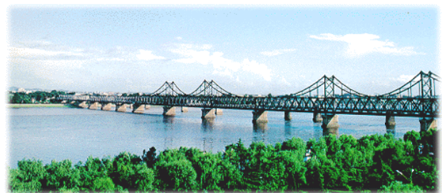
The China-Korea Friendship Bridge

Trucks rumbled across the China-Korea Friendship Bridge spanning the river. About 70 percent of trade between the two countries is said to move through Dandong.