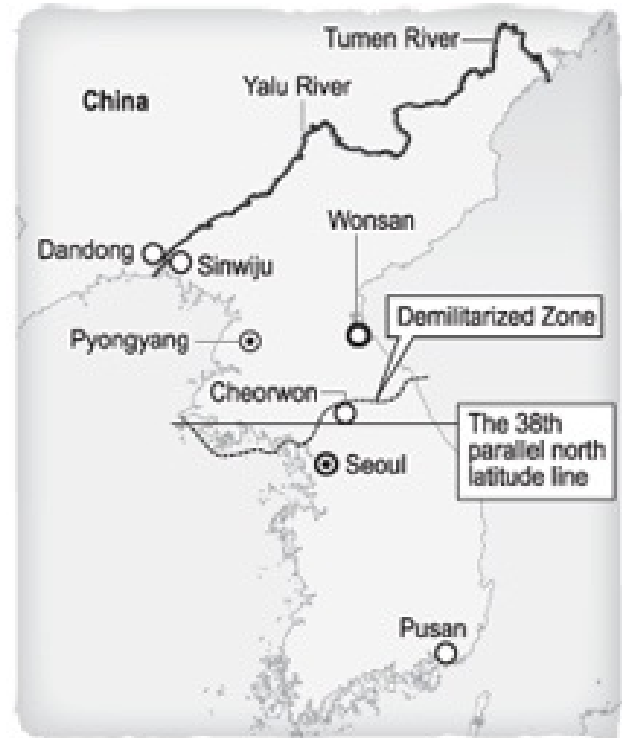
A Divided Korea and the Chinese border

In September 1945, the United States and the Soviet Union established the 38th parallel to demarcate their respective zones of control on the Korean Peninsula. The 38th parallel became the de facto North-South border when Korea was officially split in 1948.