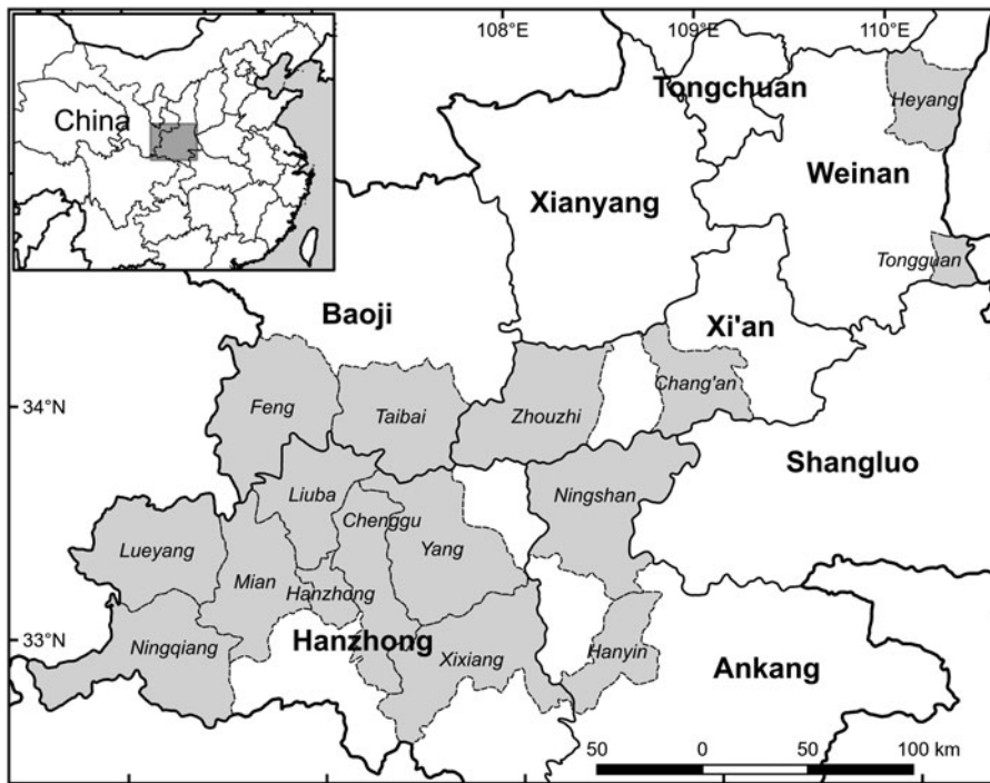
FIG. 1 Locations of cities and counties in Shaanxi Province where surveys were carried out (shaded areas) on Chinese giant salamander Andrias davidianus farms. The rectangle on the inset shows the location of the main map in China.

liver, kidney and spleen, were obtained from this animal for diagnostic investigation. DNA was extracted from tissue and swab samples using a commercially available DNA extraction kit (TIANamp Genomic DNA Kit, Tiangen Biotech (Beijing) Co. Ltd., Beijing, China), following the manufacturer's instructions for DNA extraction from tissue. The extracted DNA was analysed for the presence of ranavirus DNA, using commercially obtained primers (BGI, B-6, Beijing Airport Industrial Zone, Beijing, China) and polymerase chain reaction to detect a 466 base-pair region of the ranavirus genome coding for the C-terminal 163 amino acids of the major capsid protein, as described by Hyatt et al. (2000).