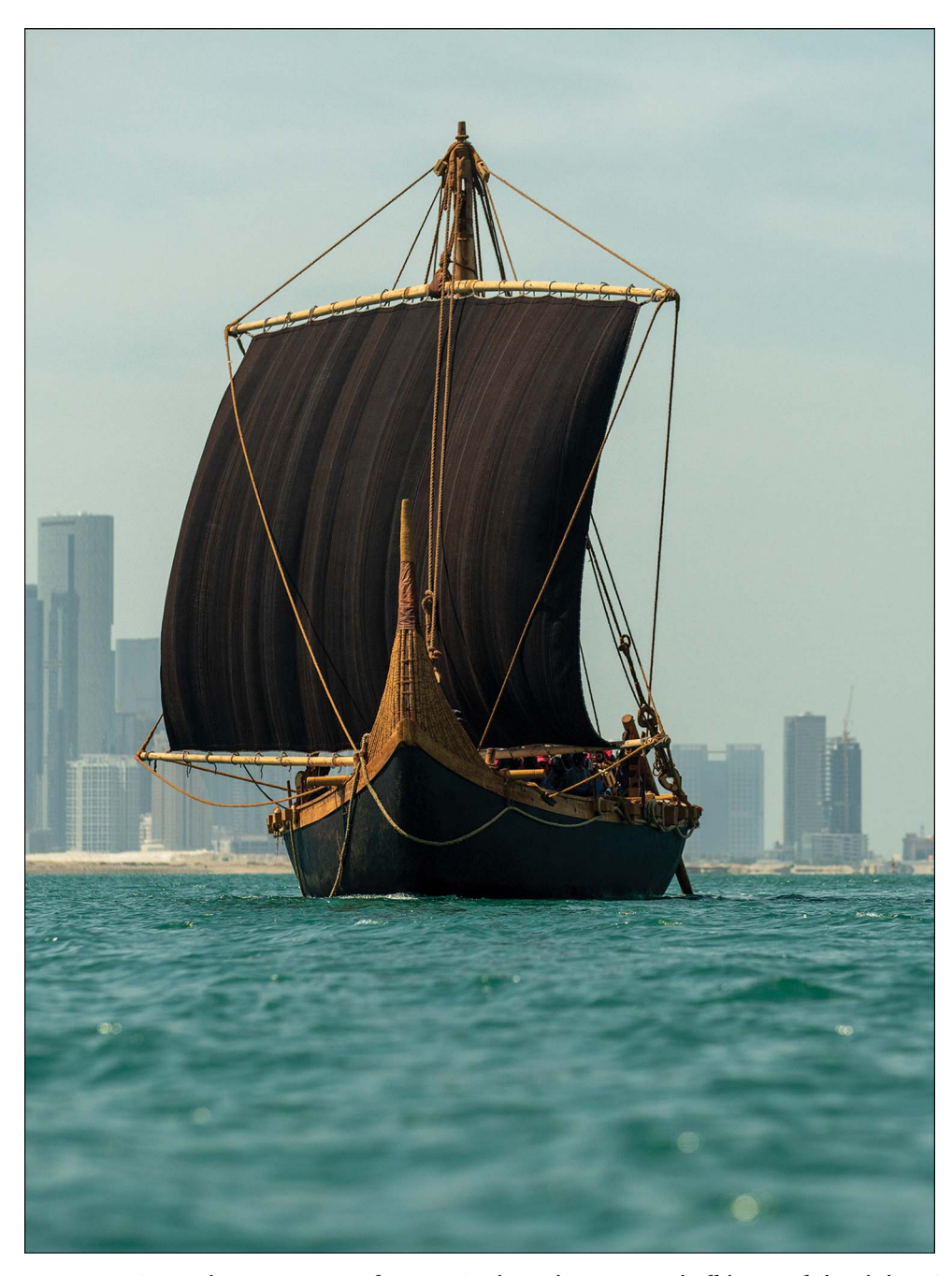
Frontispiece 2. An 18m-long reconstruction of a Bronze Age ship undergoing sea trials off the coast of Abu Dhabi, UAE, in 2024. The vessel was built by shipwrights using traditional tools to a design based on information from Sumerian cuneiform tablets and ancient representations of boats typical of the land of Magan (modern-day Oman and the UAE). The hull of the wooden-framed vessel is made of 16 tonnes of reeds lashed together with palm-fibre rope and coated in bitumen; the sail is made of goat hair. During testing, the vessel reached speeds of 5.6knots. The 'Magan Boat' is the result of a collaboration between the Zayed National Museum, New York University Abu Dhabi and Zayed University.