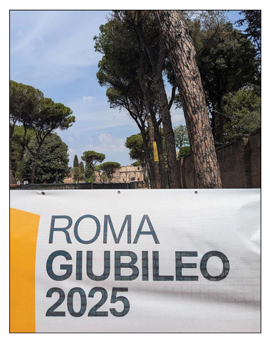
Figure 1. A screen conceals works underway on Via di S. Gregorio between the Palatine and Caelian hills, with the Arch of Constantine visible in the distance.

investigations focus on the periphery of the ancient city, illuminating the suburban areas often omitted from studies of Roman urbanism.