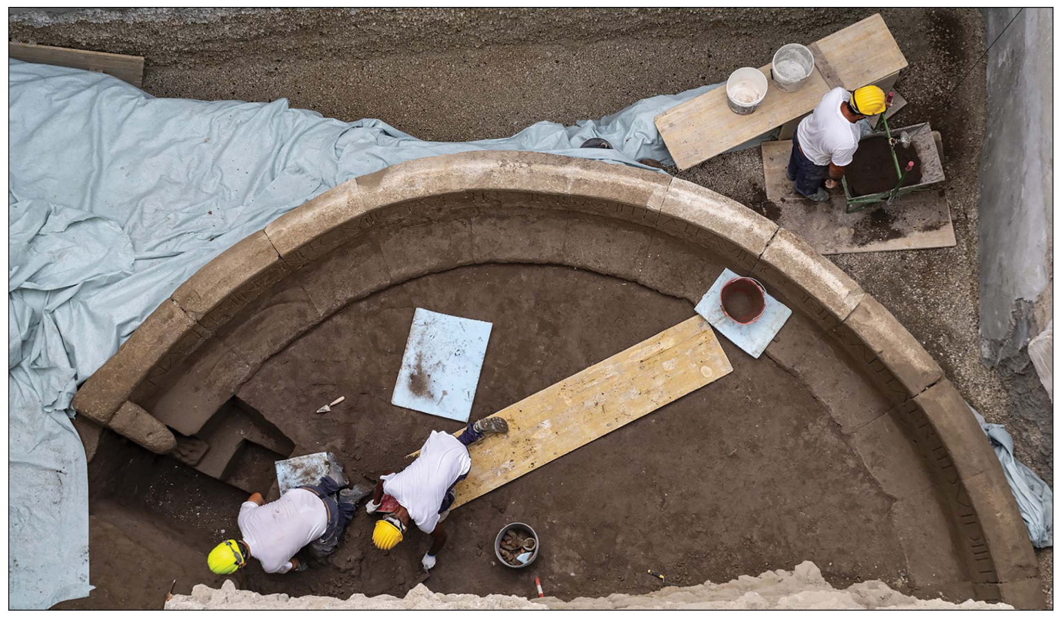
Frontispiece 1. Excavation of a 'schola' tomb discovered during work on the Pompeii Archaeological Park library building. The monument, dated to the Augustan period (27 BC-AD 14) is dedicated to Numerius Agrestinus; an inscription details his life and career. Among his various titles and roles, Agrestinus was a military tribune, prefect of the Autrygoni (a previously undocumented title), prefect of the engineers and was twice elected to the position of dumvir, one of the city's two leading magistrates. Unusually, Agrestinus was already known from another funerary inscription erected by his wife, Veia Barchilla; the city council seems to have subsequently decided to honour Agrestinus with a second monument on public land.