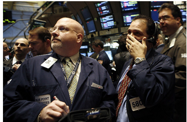
The stock market in free fall in October-November, 2008

international monetary system is in big trouble.