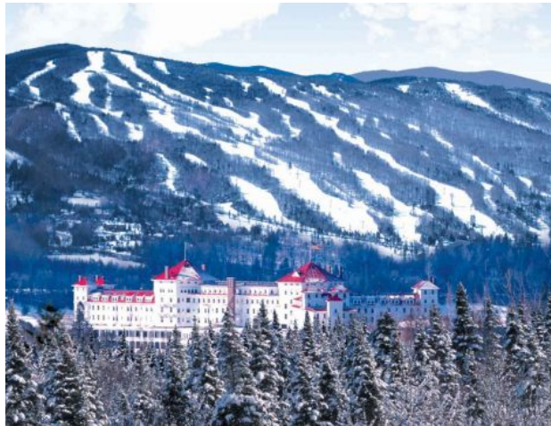
Site of the Bretton Woods conference

in July 1944. Leading British and American economists blamed the Great Depression and, to some extent, World War II on the breakup of the international monetary system in the early 1930s and were determined to create a more stable arrangement in which the dollar would replace the British pound as the accepted global currency. The new system, devised by economists Harry Dexter White and John Maynard Keynes, fixed the dollar's value at $35 for an ounce of gold. National governments, rather than speculators, were to set the value of their currencies in relation to the dollar and would have to disclose any changes in advance to the new International Monetary Fund (IMF).