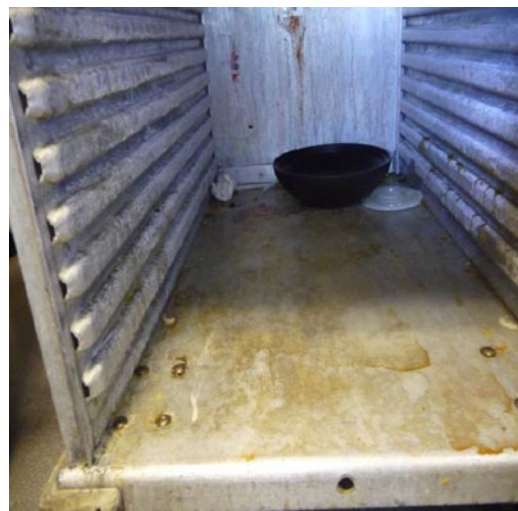
Fig. 1. Patient floor stationed food tray cart: satellite fly proliferation site.

A 3-word definition of food sanitation is protection from contamination. With this in mind, all hospital functions and operations must be included in a sanitation program. All food products must be protected from contamination from the receiving dock (and before), right through distribution and removal. Sanitation is a dynamic and ongoing function and cannot be sporadic. When embedded in a healthcare facility with a special functions (eg, surgical theatre, pharmacy, dialyses care unit, etc), it becomes even more critical. Adequate cleaning and maintenance are crucial