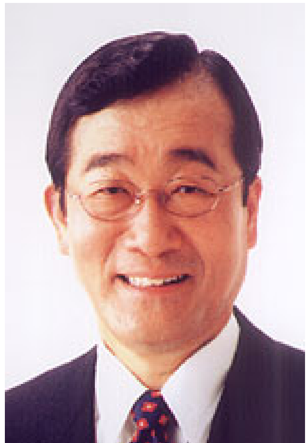
Japanese minister of agriculture Matsuoka Toshikatsu

Abe's seriousness about agricultural reform has been called in question. When inaugurating his cabinet in late September, Abe appointed Matsuoka Toshikatsu, a leader of the LDP lawmakers with close ties to the farm industry and most vocal opponent of market liberalization as minister of agriculture. Nevertheless, this month the cabinet gave the green light to entering full-fledged negotiations with Australia.