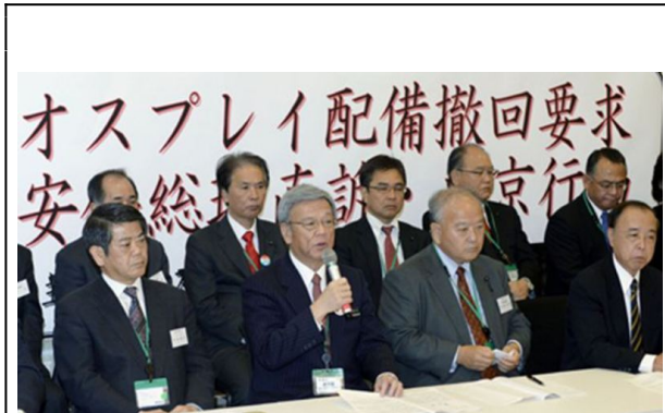
Okinawan leaders conduct press conference after submission of the Kenpakusho

abandonment of plans for a new Marine Corps base at Henoko or anywhere else on Okinawa.