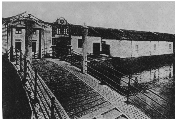
The Lius' Match Factory in Shanghai, 1935

In the first half of the twentieth century, the Lius became one of China's preeminent business families, presiding over an industrial empire that produced matches, woolens, cotton textiles, cement, and briquettes.