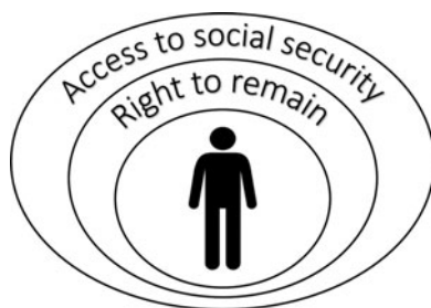
Figure 1. A layered conception of citizenship