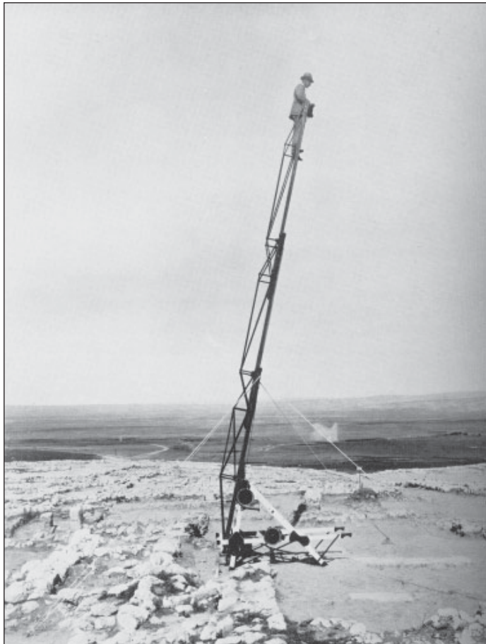
Antiquity's new search facility will allow you to unearth such ancient gems as this, from Volume 6, 1932.

With these things in mind, we have devised the following scheme, and I hope readers will permit me to take a few lines to describe it. The first thing to say is that the printed journal will go on being delivered in printed form so long as there is any demand for it. Those who like the printed journal shall continue to get it, regularly and pleasurably we hope. So what will the on-line journal look like and how will one read it? With one exception, it will resemble the printed journal in every particular, and that exception is the inclusion, in the on-line journal only, of certain tables and lists that