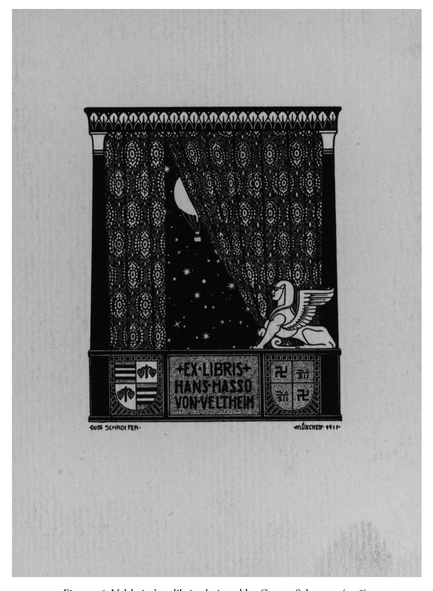
Figure 16 Veltheim's exlibris, designed by Gustav Schroeter (1918), in Hans-Hasso von Veltheim Archive, Ostrau. Depositum Veltheim at the Universitäts- und Landesbibliothek Sachsen-Anhalt, Halle (Saale)