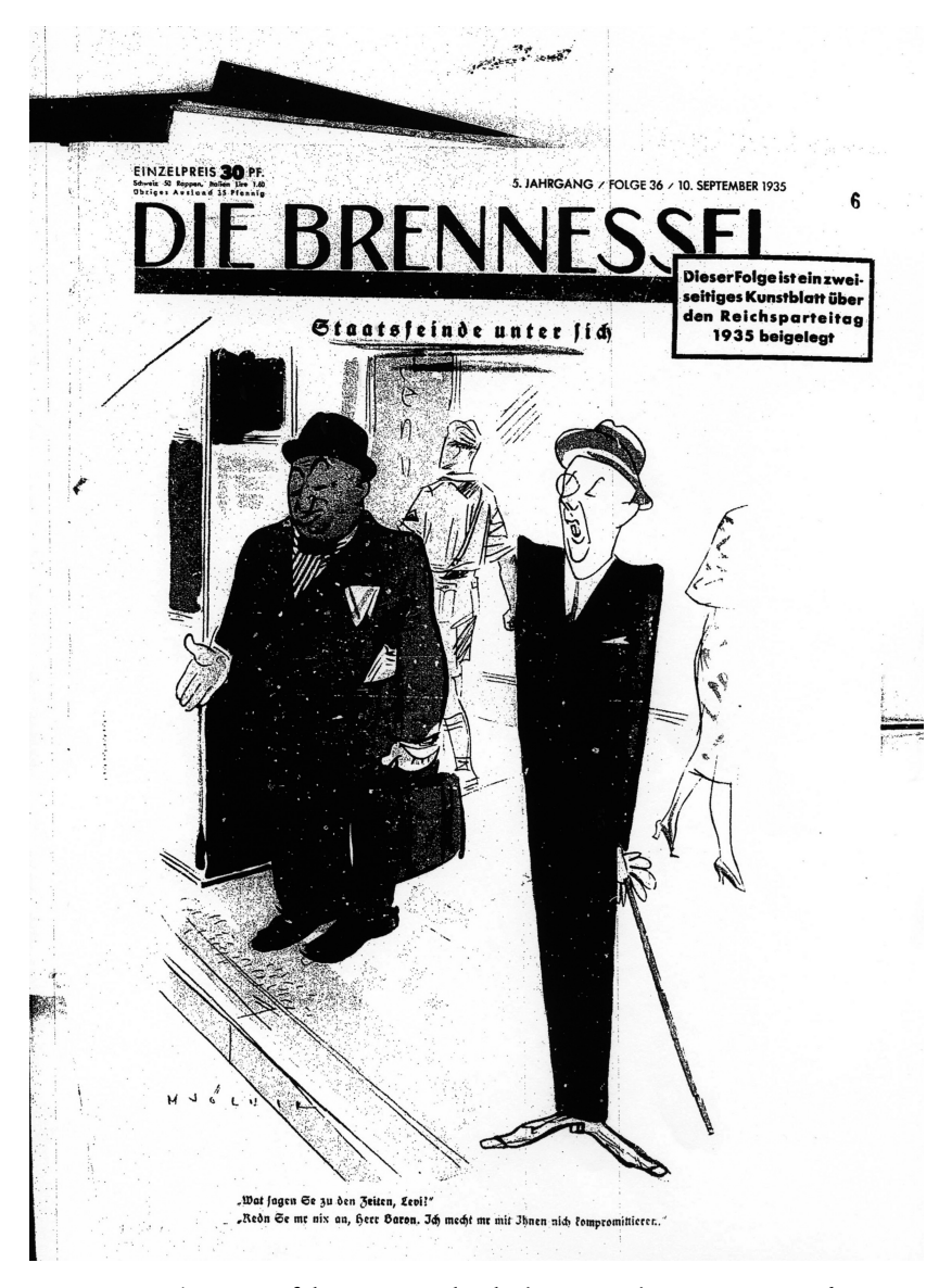
Figure 20 'Enemies of the state in each other's company', in: Die Brennessel , 5:36 (10 September 1935). BA R 43 II 1554–5, 61ff.