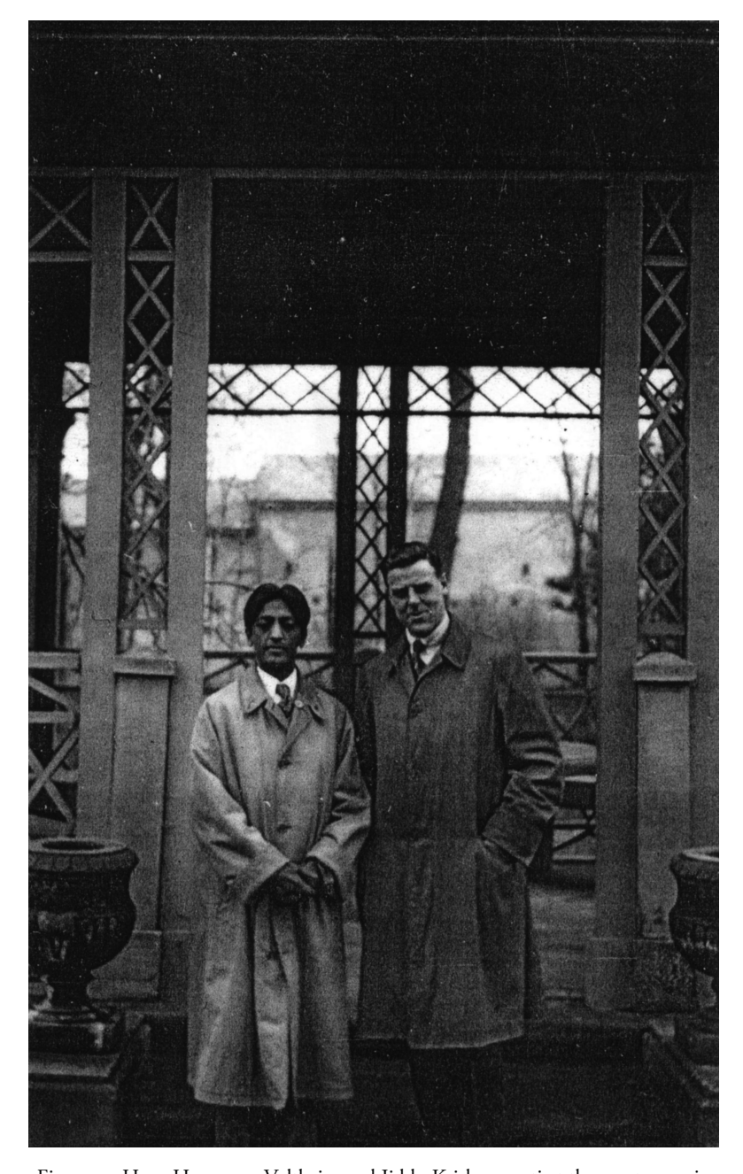
Figure 17 Hans-Hasso von Veltheim and Jiddu Krishnamurti at the sun terrace in Ostrau (April 1931)