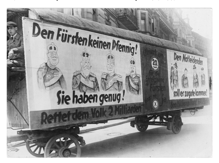
Figure 15 'Not a penny for the princes!' Election poster from Germany, 1926. 'Den Fürsten keinen Pfennig! Sie haben genug! -rettet dem Volk 2 Milliarden Den Notleidenden soll es zugute kommen!' [Not a penny for the Princes! They have enough! – save 2 billion for the people/It should benefit those in need!] Election propaganda car (1926); Aktuelle-Bilder-Centrale, Georg Pahl. Source: Bundesarchiv, Image 102–00685

In the early twentieth century, German aristocrats had become objects of satire in Germany and in the Habsburg lands. The Munich-based satirical magazine Simplicissimus ridiculed the Ostelbian Barons as symbols of the old world. 'Let them cremate you, papa, then you won't have to turn so much later on,' reads the caption on one caricature dating from 1906 [Fig. 14].