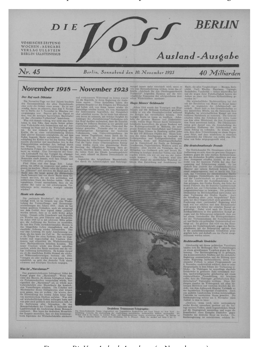
Figure 13 Die Voss, Auslands-Ausgabe, 45 (10 November 1923), 1