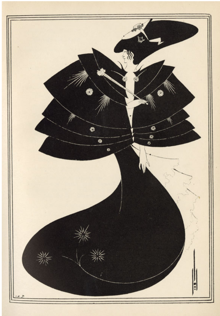
Figure 1. Aubrey Beardsley, “The Black Cape.” From Oscar Wilde, Salomé (London: Elkin Matthews and John Lane, 1894).