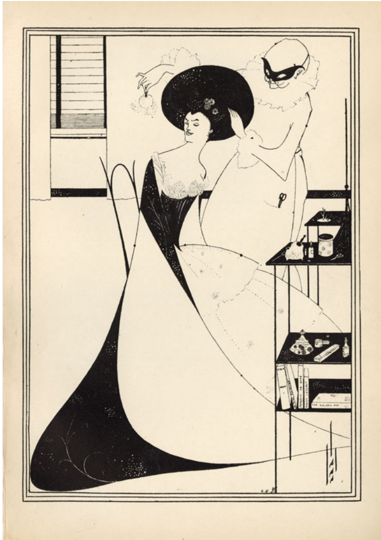
Figure 6. Aubrey Beardsley, “The Toilette of Salomé.” From Oscar Wilde, Salomé , 1894.

sexuality, or even taking pleasure in her own appearance without any need for a male spectator. The woman supervising her own makeup or hair-styling is an agent of self-creation: she becomes her own work of art.