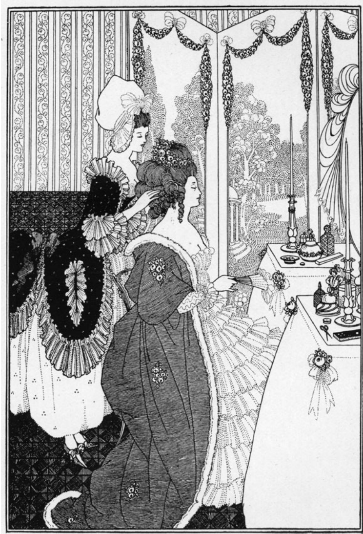
Figure 7. Aubrey Beardsley, “The Toilet.” From Alexander Pope, The Rape of the Lock (London: L. Smithers, 1896).

(fig. 5), she’s surrounded by a group of servants, two of them nude, one standing ready with a tea tray. These details point to some of the tricky political connotations underlying Beardsley’s imagery. On one hand, Salomé in particular centers on a disempowered princess who attempts to seize control over both a tyrannical king and a male religious zealot. The play’s final grotesque imagery, in which Salomé holds aloft John