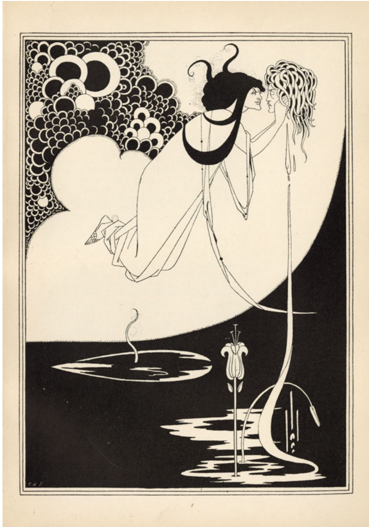
Figure 2. Aubrey Beardsley, “The Climax.” From Oscar Wilde, Salomé (London: Elkin Matthews and John Lane, 1894).