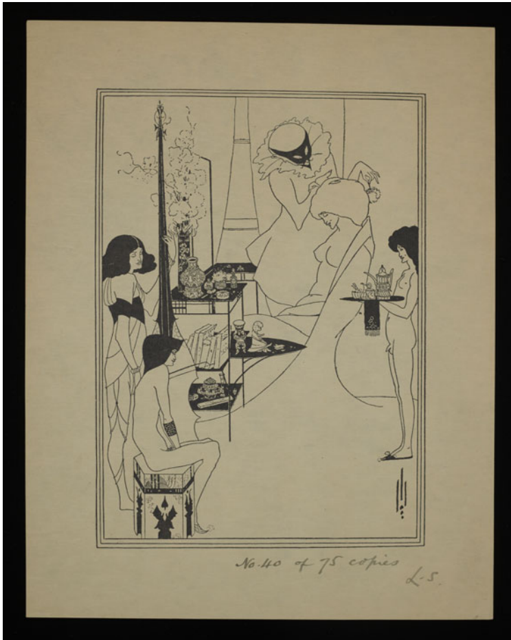
Figure 5. Aubrey Beardsley, “The Toilette of Salomé.” First version. Broadside, 23 x 18 cm., 1894.

hint at the more ominous and gruesome violence that will unfold at the play’s end. Books on Salomé’s bookshelf mention Zola’s Nana , the Marquis de Sade, and “ Les Fêtes Galantes ”—tracing a lineage of outré French sexuality from the eighteenth into the nineteenth centuries. Both Salomé and Belinda are players in a power game, mock-epic in Pope and slant biblical epic in Wilde. In the original Bible story, princess Salomé is merely an obedient daughter to her mother; in Wilde’s play, though, she becomes her own perverse agent working against Herod’s dominant power, using her sexuality as her only available weapon. Beardsley’s images amplify these moments of female agency, showing a female figure preparing to dominate over a man by amplifying her