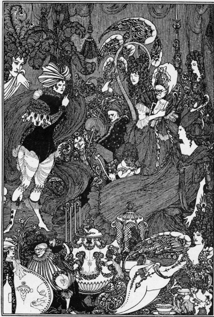
Figure 4. Aubrey Beardsley, “The Cave of Spleen.” From Alexander Pope, The Rape of the Lock (London: L. Smithers, 1896).

talking jars; “Men prove with Child, as pow’rful Fancy works, / And Maids turn’d Bottels, call aloud for Corks.” The bodies of Beardsley’s figures are likewise distended and grotesque, insinuating strange pregnancies and weird mixtures of human flesh and ceramic vessels. The grotesque was a venerable Victorian style with weighty resonances; for John Ruskin, it signified a profound authenticity, linking ugliness to truth. Grotesque