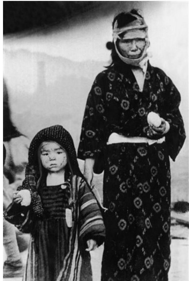
Mother and child, Nagasaki Aug 9, 1945.

Sixty-two years after the first atomic weapon was tested in New Mexico, international jurors issued a verdict on the atomic bombings, finding U.S. leaders guilty of war crimes and crimes against humanity.