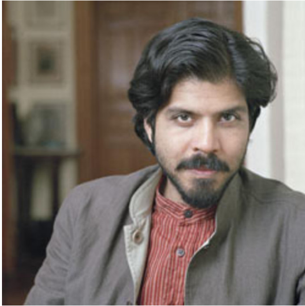
Writer Pankaj Mishra, who questions India's "nation rising" euphoria and the superpower status many there feel its nuclear weapons bestow. Nina Subin

The media has not been helpful, and rather is part of the problem because it has been jingoistic and nationalistic regarding nuclear weapons. India is in the grip of a "nation rising" euphoria and sees nuclear weapons contributing to the glory and international prominence of India, putting it on an imaginary par with the United States, Russia and China as a great superpower. Nuclear weapons are emblematic of national pride and widely supported by the public out of their ignorance about what they can do and what would happen if India launched one.