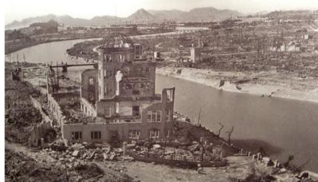
Ground Zero, Hiroshima, August 6, 1945.

draws on interviews in Japan, India and Pakistan to assess their ongoing political and social fallout.