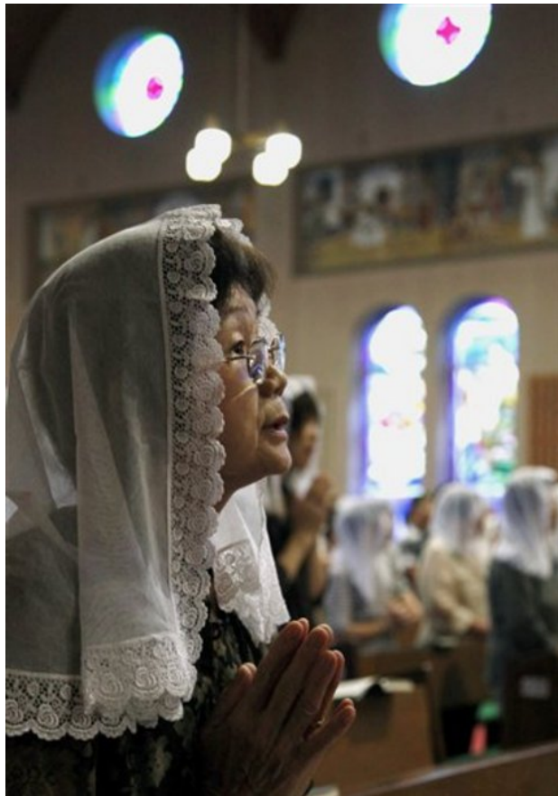
A woman prays in Nagasaki's Urakami Cathedral on Aug 9, 2009.

So at the government level there already is reconciliation, but not among the victims. The hibakusha are not reconciled, and are still waiting for an apology. Even after they die, the people of Hiroshima and Nagasaki and the descendants of hibakusha will still demand justice and keep the issue alive, just as in Nanjing the Chinese have sustained their campaign for justice. It won't fade away. The past continues to haunt the present.