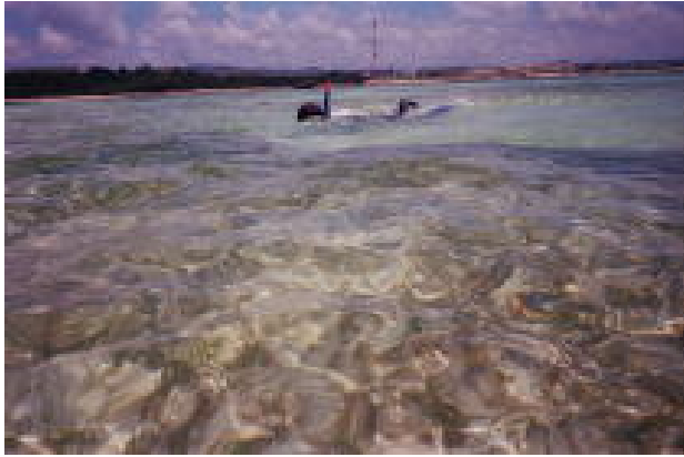
The dugong habitat with Camp Schwab in the background

The Japanese government appears committed to the construction of the base at Henoko and prepared to deal with any criticism while international interest in the environment of Henoko has risen.