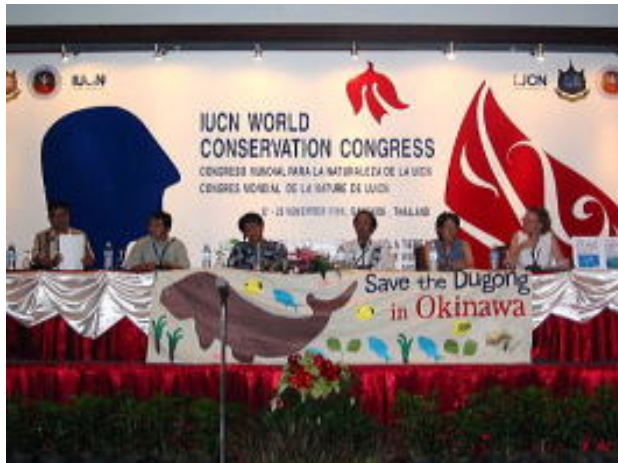
IUCN World Conservation Conference

Japanese government's EIA. The representative of the US Department of the State refused to accept the draft, arguing that the US government could not intervene in the matters of a "sovereign state." The final and compromised version of the recommendations urged the US government to "cooperate, if requested, in the environmental impact assessments carried out by the Government of Japan for military base site construction." [20] To date, however, there has been no sign that the Japanese government has asked the US government and military to do so.