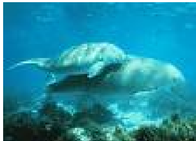
The dugong at sea