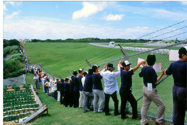
Protesters link hands encircling Futenma Base

in Okinawa. On this point, the Okinawan people across party lines are unified and have made plain in successive elections at every level and in repeated demonstrations of massive scale.