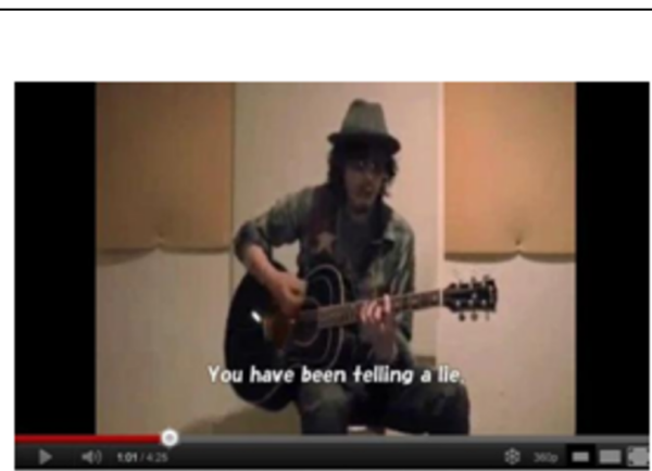
Saito Kazuyoshi's song, with English subtitles ( LINK to view video )