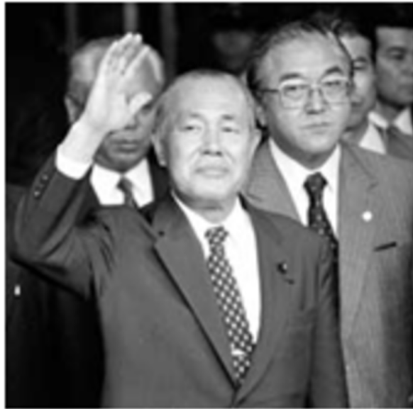
Tanaka Kakuei (1918-1993)

Following in Shoriki and Nakasone's footsteps as the standard bearer for nuclear power was former prime minister Tanaka Kakuei, famed for his Plan for Remodeling the Japanese Archipelago.