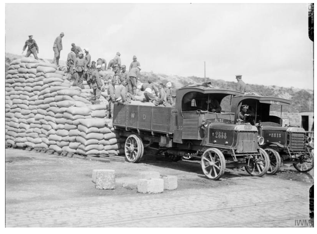
Cap badge of the Chinese Labour Corps CLC personnel moving sacks of corn at Boulogne, on 12 August 1917