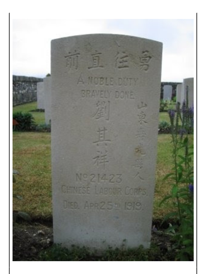
Tombstone of a CLC member, a physical reminder of their legacy

WWI, Great War, CLC, Chinese Labour Corps, Nation-Building, Versailles