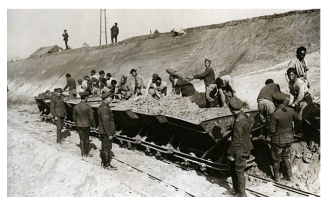
Handling ammunition was one of the many tasks the CLC performed

Building roads was a very important task for the CLC, given the need to sustain industrial warfare on a grand scale in the Western Front