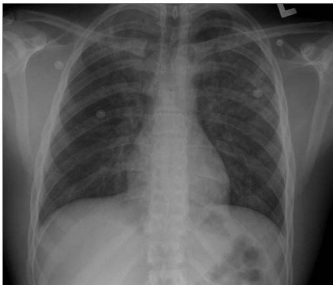
Fig. 3. Repeat chest radiographs taken 8 hours after injury showing mild, interval improvement in the upper lobe air-space disease and increased involvement of the mid and lower lung zones.

Widespread implementation of automobile airbags in MVCs has resulted in a substantial reduction in mortality. 1 However, this increased use has also been associated with new patterns of injury caused by airbag deployment. These injuries, while minor compared with those associated with non-use, include fractures, chemical burns, blunt cardiovascular trauma, ophthalmologic injury and soft tissue injuries. 4-6 A review of the literature (Medline 1966 to 2006 using the MESH terms airbag injuries, sodium azide, airbag and pneumonitis) identified few cases of inhalation injuries related to the release of toxic compounds during airbag deployment. 7-12 One case of subglottic injury was reported following airbag rupture causing a clinical presentation of bronchospasm in a patient with underlying lung disease. 8 Gross and colleagues reported that 40% of asthmatics experienced significant bronchoconstriction after airbag deployment. 7 Further studies suggested the primary irritant was the particulate matter and not the gaseous com-