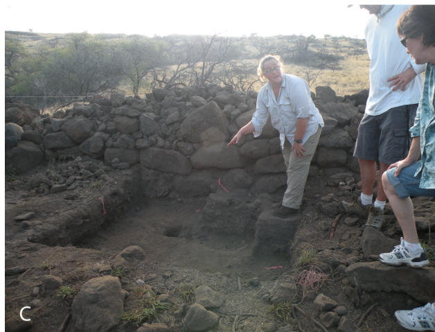
Figure 2 Examples of surface architecture in study area: A) Small enclosure from within the field system (MKI-303), basal cultural deposit dates to Period I; B) Large terrace with windbreak wall, from coast (KAL-30A); hearth features date to Period II; C) Large enclosure with massive walls and basal stones (MKI-56); coral from beneath wall dates structure to Period III.