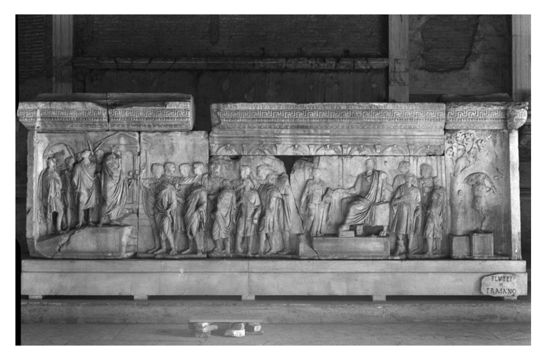
Fig. 5. Anaglypha Fori, alimenta panel, Curia Julia in the Forum Romanum, 2nd c. CE. The Marsyas statue is the first figure on the right.

The enclosure behind the lamp satyrs deserves some comment, especially as it is absent from other depictions of the Forum Marsyas. Latticed fencing of this kind ( cancelli ) was common in both civic and domestic contexts in the Roman world.<sup>34</sup> For example, the