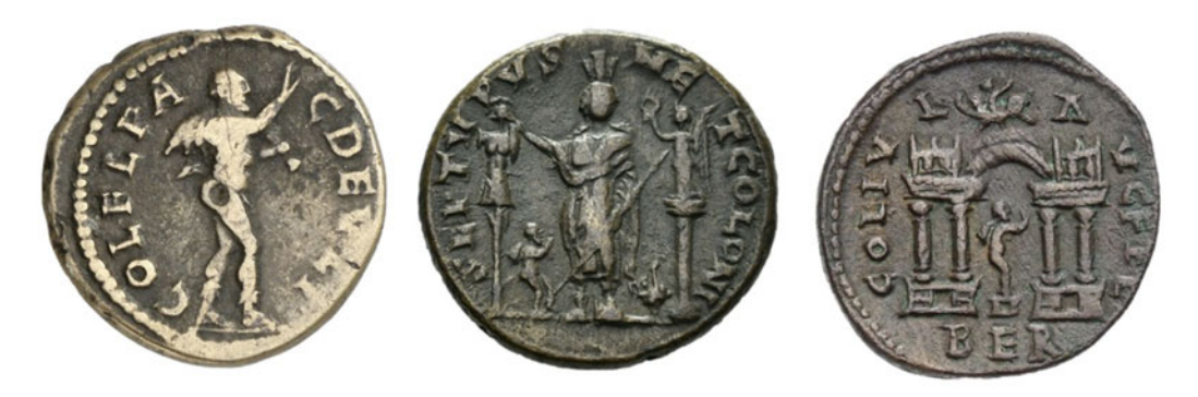
Fig. 6. Note: images not to scale. From left: Reverse of bronze coin of Gordian III, Deultum, 241–42 CE. 7.32 g/23 mm/7h. Münzkabinett der Staatlichen Museen zu Berlin, 18248913. Reverse of bronze coin of Caracalla, Tyre, 209–17 CE. 13.67 g/26 mm/6h. Münzkabinett der Staatlichen Museen zu Berlin, 18257514. Reverse of bronze coin of Elagablaus, Berytus, 218–22 CE. 19.15 g/29 mm/1h. Münzkabinett der Staatlichen Museen zu Berlin, 18202840.

numismatic evidence, between the Forum Marsyas and municipal or colonial status does not hold for the provenienced lamps, none of which are found at such sites.<sup>56</sup> We will return momentarily to the implications this has for interpreting the satyr as an object of political art.