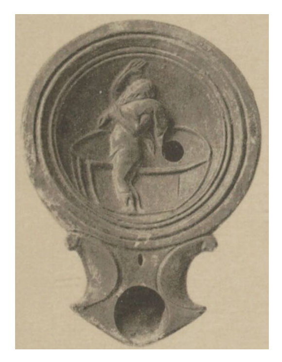
Fig. 2. Terracotta oil lamp of unknown origin, 1st c. CE. 76 mm across. Formerly in the Jules Sambon Collection. (Image after Sambon 1911.)

unknown is whether the lamp was manufactured in Cyprus or imported; while most ex-Cesnola lamps are presumed to be locally made Cypriot products, making such an assessment in the absence of a maker's mark or compositional analysis is problematic.<sup>11</sup>