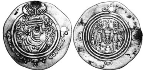
Figure 2. Issue of Kharasha from Dārābjird.