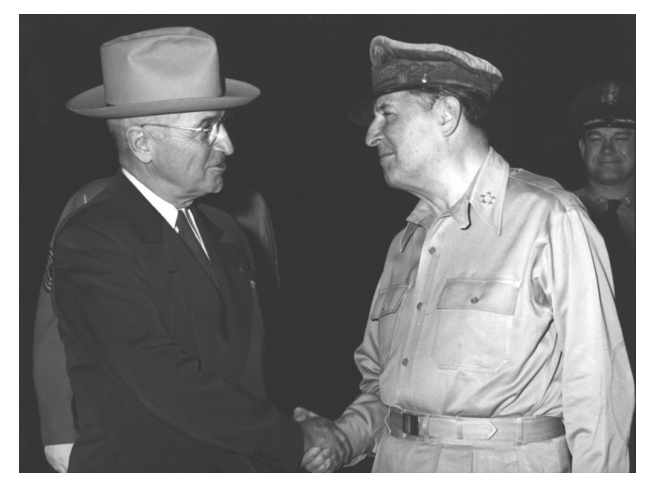
MacArthur and Truman, Wake Island, Oct 15, 1950