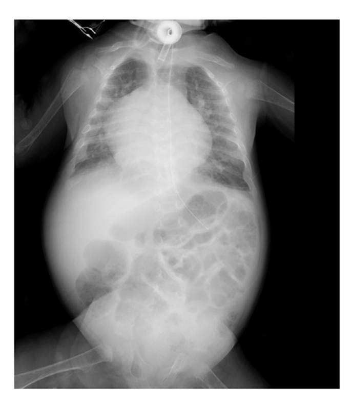
Figure 1. Chromosome test result shows that the chromosome is 46,XY,der(2) t(2;3)(q37.3:p21.3).