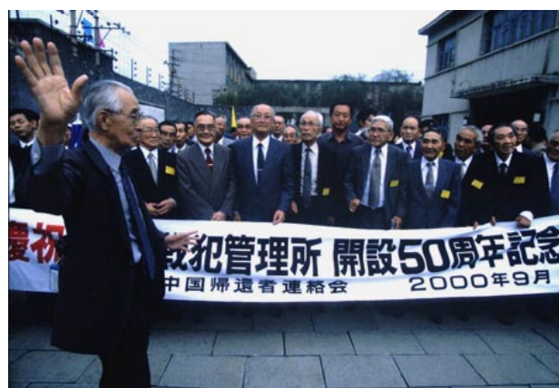
Chukiren celebrates its fiftieth anniversary in September 2000

Unfortunately, as we entered the year 2000, our average age surpassed 80, and many of those who worked tirelessly began to pass away.