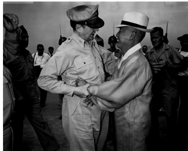
Rhee and MacArthur

[Japan's] reconstruction" be forcefully repatriated. Here he remarked that since they were "mostly North Koreans" ( sic ) they "would [all] have their heads cut off" by the ROK government. [47] Labeling this population as "mostly North Korean" was untrue in that the vast majority of Japan-based Koreans came from southern Korean towns. The idea that MacArthur suggested, that most Koreans were DPRK-influenced communists, was also problematic in its assumption that Japan-based Koreans could only adopt this ideology from a foreign influence. This exchange also suggested as a definition of "communist" any Korean unwilling to contribute to Japan's reconstruction, or, more simply put, a troublemaker. Both leaders neglected to consider why, considering the long history of Japanese discrimination they endured, any Korean would be interested in assisting in Japan's recovery.