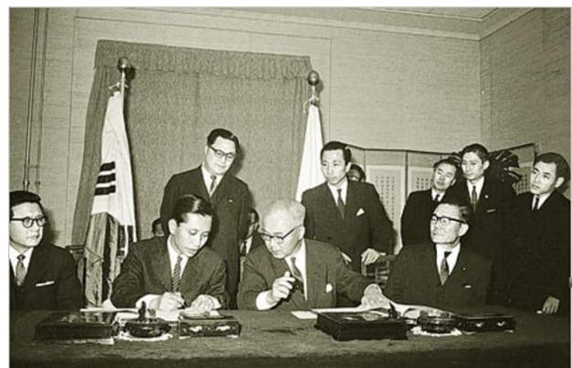
Korean Foreign Minister Lee Tong-won and Japanese Foreign Minister Shiina Etsusaburo sign the Treaty on Basic

Japan and the ROK finally came to agreement in 1965, at the time they signed a treaty of normalization. At this time they also signed the Agreement on Legal Status and Treatment of South Korean Residents in Japan that offered permanent resident status to Koreans who could prove sustained residence in Japan from prior to August 15, 1945, and who had registered as ROK nationals. The agreement had nothing to offer those Koreans affiliated with Choryŏn , whose members essentially became stateless. Mindan Koreans also criticized the agreement. In June 1965, 10,000 of its members assembled in Hibiya Park to demonstrate for terms more equal to Japanese than those they gained by their becoming permanent residents.