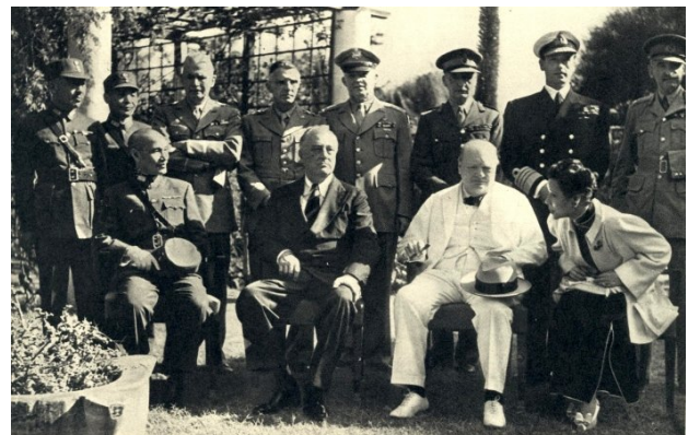
Generalissimo and Madame Chiang Kai-shek flank Roosevelt and Churchill at

The Allied powers formally addressed the issue of postwar Northeast Asian occupation in Cairo, where the U.S., Great Britain, and China signed a communiqué in December 1943. The three signatories proclaimed for the first time that Japan would forfeit its control over the Korean Peninsula. They also agreed to delay Korean independence by adding the often-quoted phrase, "in due course Korea shall become free and independent." The Allied leaders declaring that Japan would lose possession of the Korean peninsula marked an important clarification regarding Korea's post-liberation status. Remarks by American and Japanese officials suggesting that it was a mistake to separate Korea from Japan could be heard both before and after U.S. occupations had begun.