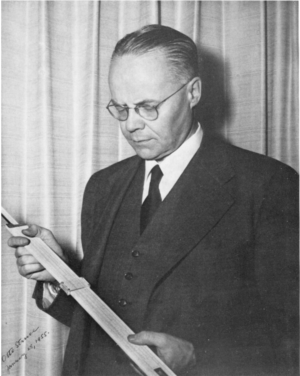
PROF. OTTO STRUVE