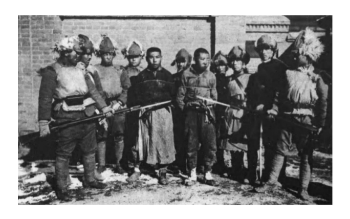
Captured partisans (Manchurian Incident Photo Album, Chukoh no Nihonsha 1932)

Following the Mukden Incident, the construction of railways and roads for military purposes proceeded on a large scale throughout Manchuria. By 1934, with Manchuria under military control and with the founding of the puppet state of Manchukuo, a degree of political stability was established in Rehe. However, anti-Japanese resistance continued. Military subjugation of rebels became an ongoing mission of the Kwantung Army. The Japanese at the time commonly used the term "bandits" (匪賊 or hizoku) to refer to the anti-Japanese organization that resisted Japanese domination.