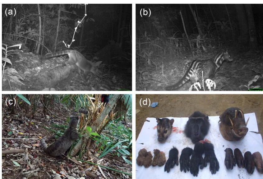
PLATE 1 Camera-trapped (a) Sulawesi civet Macrogalidia musschenbroekii in primary forest in Bogani Nani Wartabone National Park, showing its characteristic striped tail (February 2017), and (b) Malay civet Viverra zangalunga (August 2017) in Tangkoko Natural Reserve, and (c) snared Sulawesi civet found by a National Park ranger patrol team (March 2018), and (d) examples of bushmeat seen at a road-block patrol for monitoring wildlife trade in Maelang (from left to right Sulawesi civet, black-crested macaque Macaca nigra and babirusa Babryrousa celebensis ) in 2013.

We recorded the Sulawesi civet 13 times at eight stations in the National Park, and with two opportunistic records from two locations. These records were from altitudes of 271–1,093 m, from primary forest (three of 21 stations), secondary forest (3/17) and farmland (2/9; Table 1, Fig. 1). From the Tangkoko Nature Reserve there were two Sulawesi civet records from farmland (2/5 stations), 85 and 450 m from forest, including one recorded at the same station as a Malay civet. Our study is the first to confirm the presence of the Sulawesi civet with photographic records in both Bogani