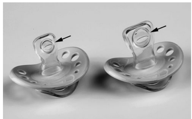
Fig. 2. The novel slow-release pacifier with pouch (↑).