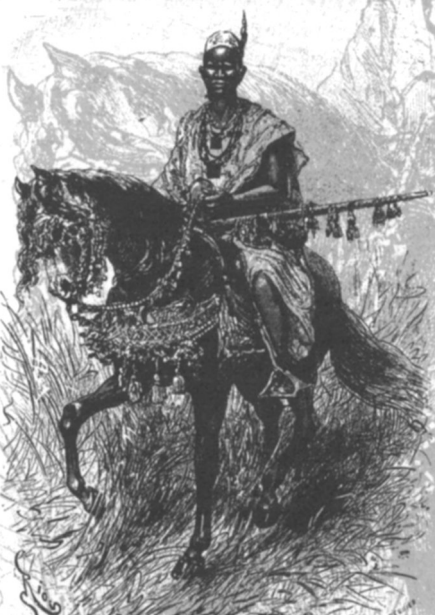
Toucouleur horseman. From Joseph Gallieni, Deux campagnes au Soudan français (Paris, 1891).