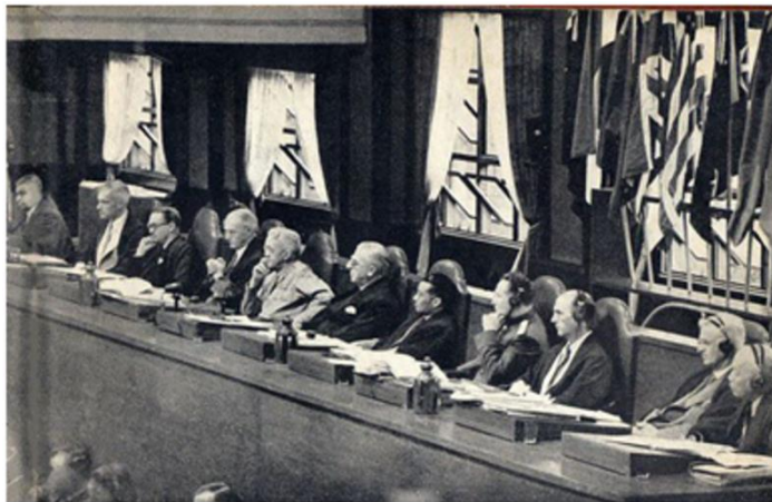
The Justices (Pal on the left)

Whether or not these acts constituted any crime should be left open for determination by the Tribunal with reference to the appropriate laws. From this point of view, he strongly condemned the Tokyo Charter as widely departing from the fundamental rule of jurisdiction.