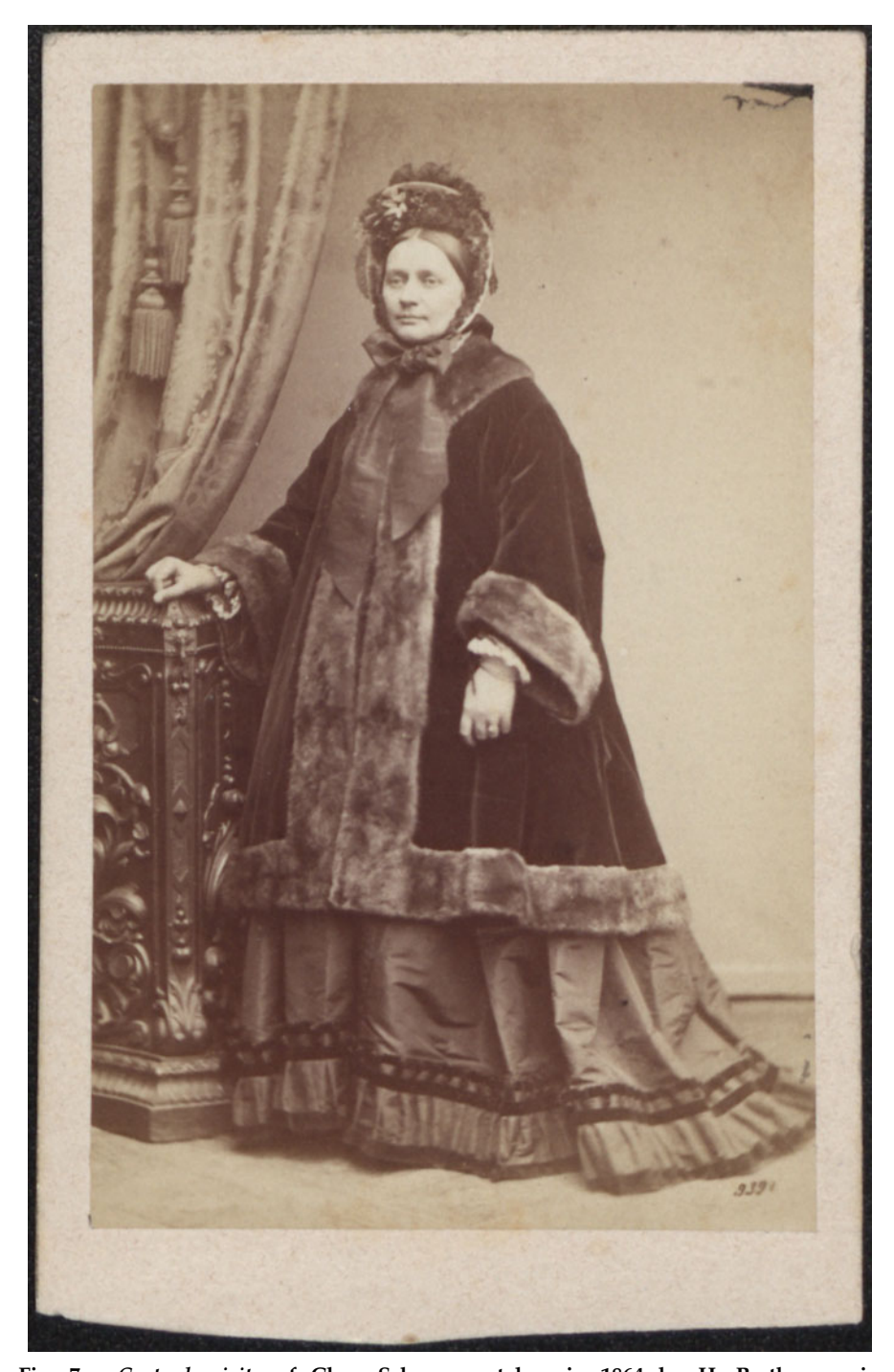
Fig. 7 Carte-de-visite of Clara Schumann taken in 1864 by H. Prothmann in Köningsberg. Courtesy of the Robert Schumann Haus in Zwickau.