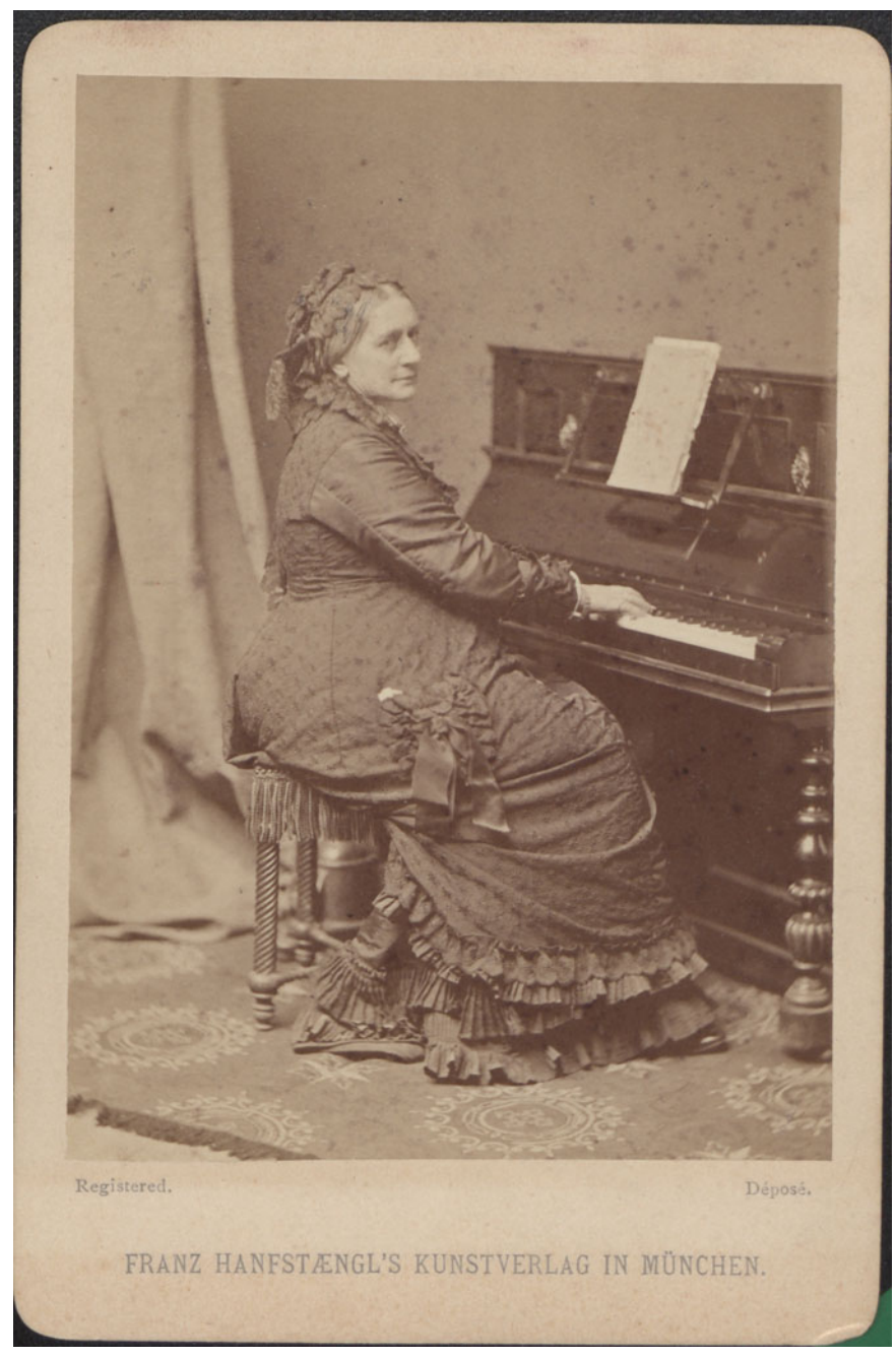
Fig. 3 Cabinet Card of Clara Schumann taken around 1878 by Franz Hanfstaengl in Munich.

spectacular bonnet with its large bow, flowers and lace trim accents her fur-lined travelling coat, ruffled sleeves and billowing, embellished skirt. Schumann's fashionable dress, while calling attention to her movement through both public and