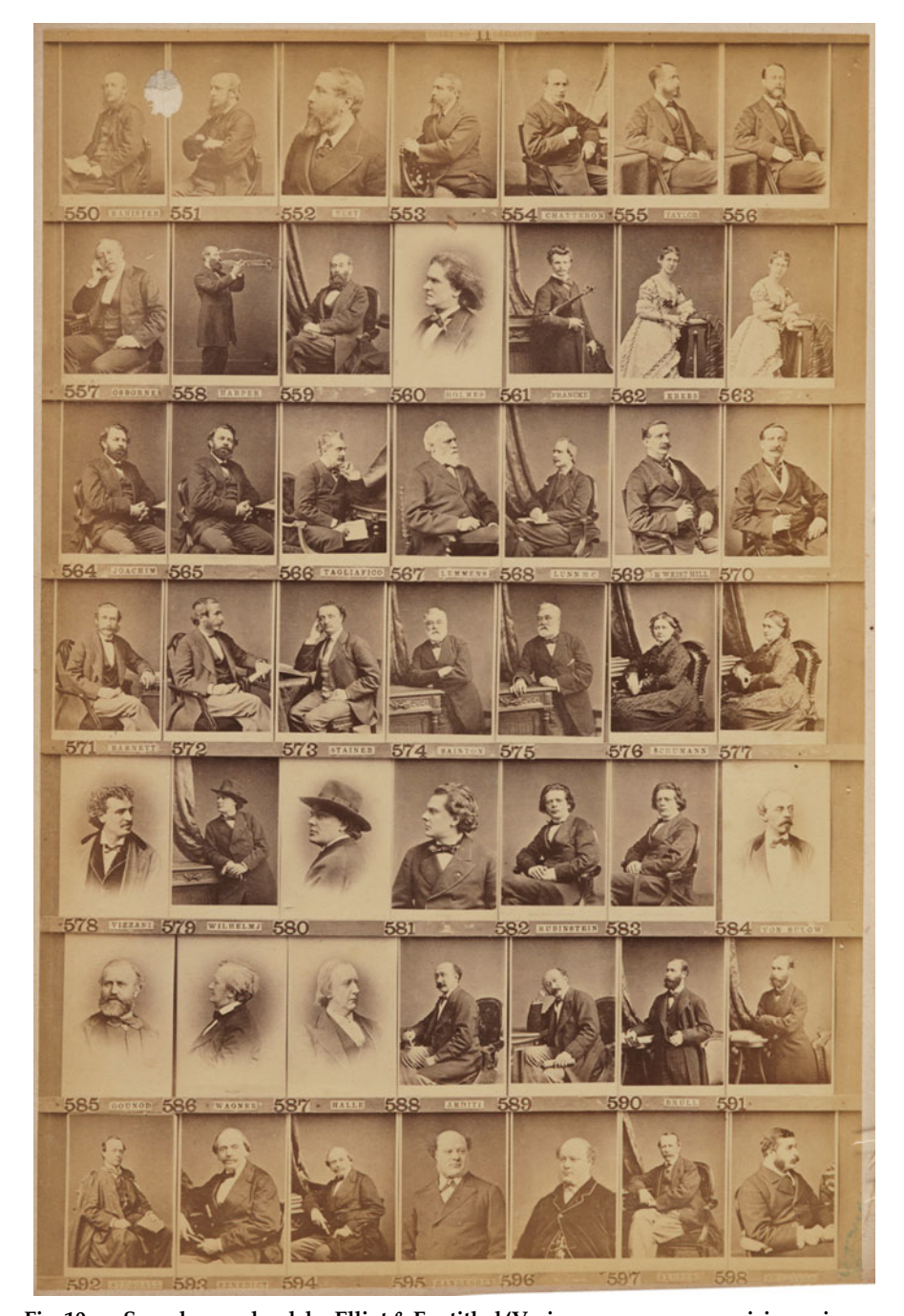
Fig. 10 Sample page book by Elliot & Fry titled 'Various composers, musicians, singers and others'. Clara Schumann's photographs are on the far right of the fourth row (576 and 577). Bromide Print.