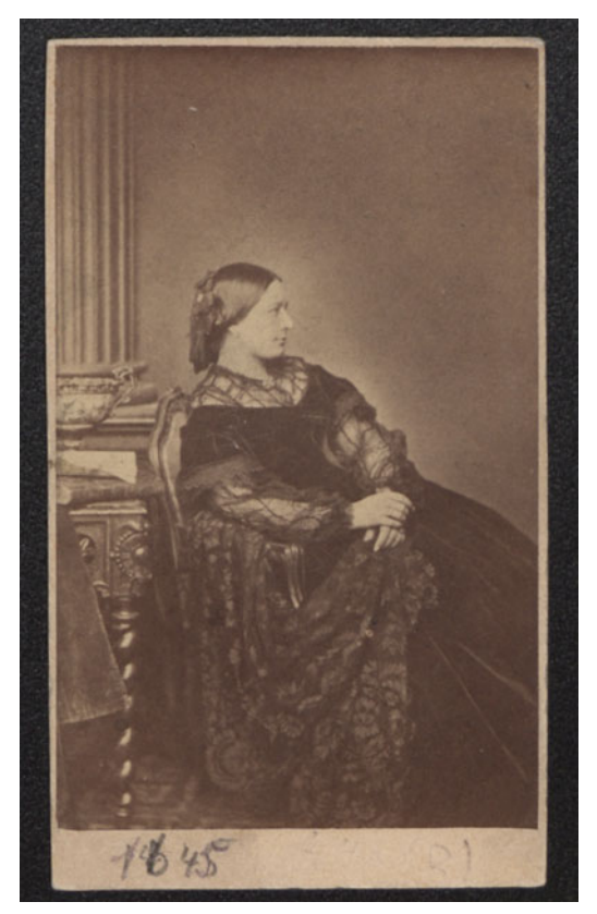
Fig. 1 Carte-de-visite of Clara Schumann taken around 1862 by an unknown photographer. Courtesy of the Robert Schumann Haus in Zwickau.

the objects initiate associations to her active performing career, middle-class identity, powerful musicality and, inevitably, to her transgressive femininity as a publicly performing woman. As with the commodity status of Schumann herself, these commodities find ways to normalize and disrupt.