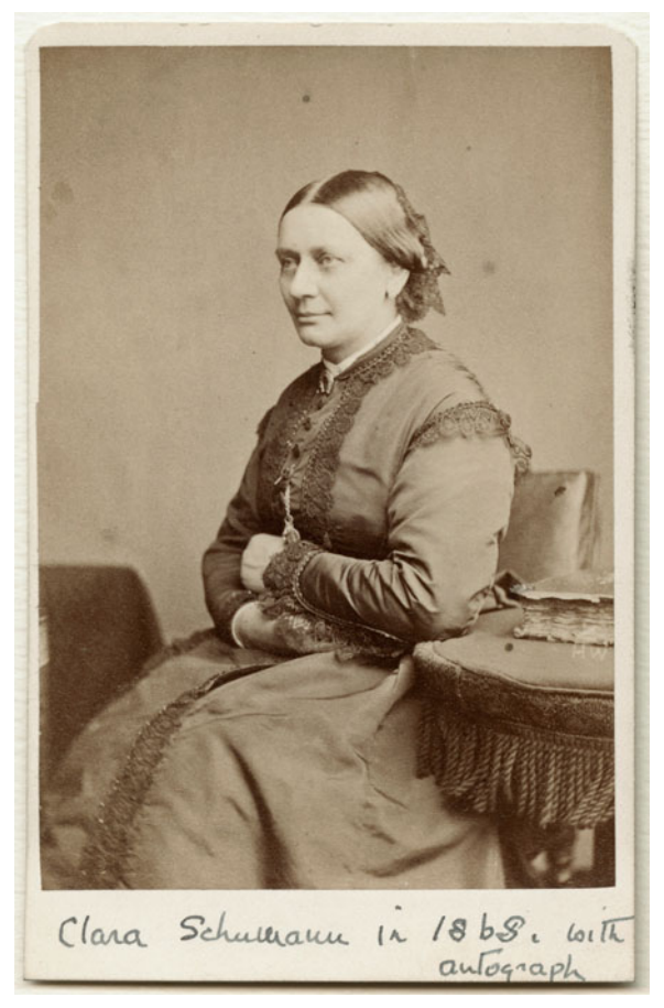
Fig. 6 Carte-de-visite of Clara Schumann taken around 1868 by Herbert Watkins in London.

The 'junk' in Schumann's cartes-de-visite , therefore, intertwine her public and private identities almost effortlessly – these things can become highly political. While often mundane and quotidian, the everyday, unquestionable commodities at the centre of Schumann's (seemingly) banal photographs could conform to the dominant bourgeois aesthetic or fade into the background. Many of these choices, in fact, confirm Schumann's class and gender belonging, and the 'sublimation of the individual to the mass'. Because of her celebrity status, however, Schumann-as-commodity could instigate more attention to her individuality, not necessarily less. The props can just as easily provoke, confound and, in so doing, demand the viewer's attention. To be sure, these artefacts seemingly delight in stimulating fanciful and sentimental reactions in their viewers; as a commodity Schumann becomes intimately connected to those that look. In carte form, her associated piano virtuosity is powerful in its ambiguities. She is divinely inspired,