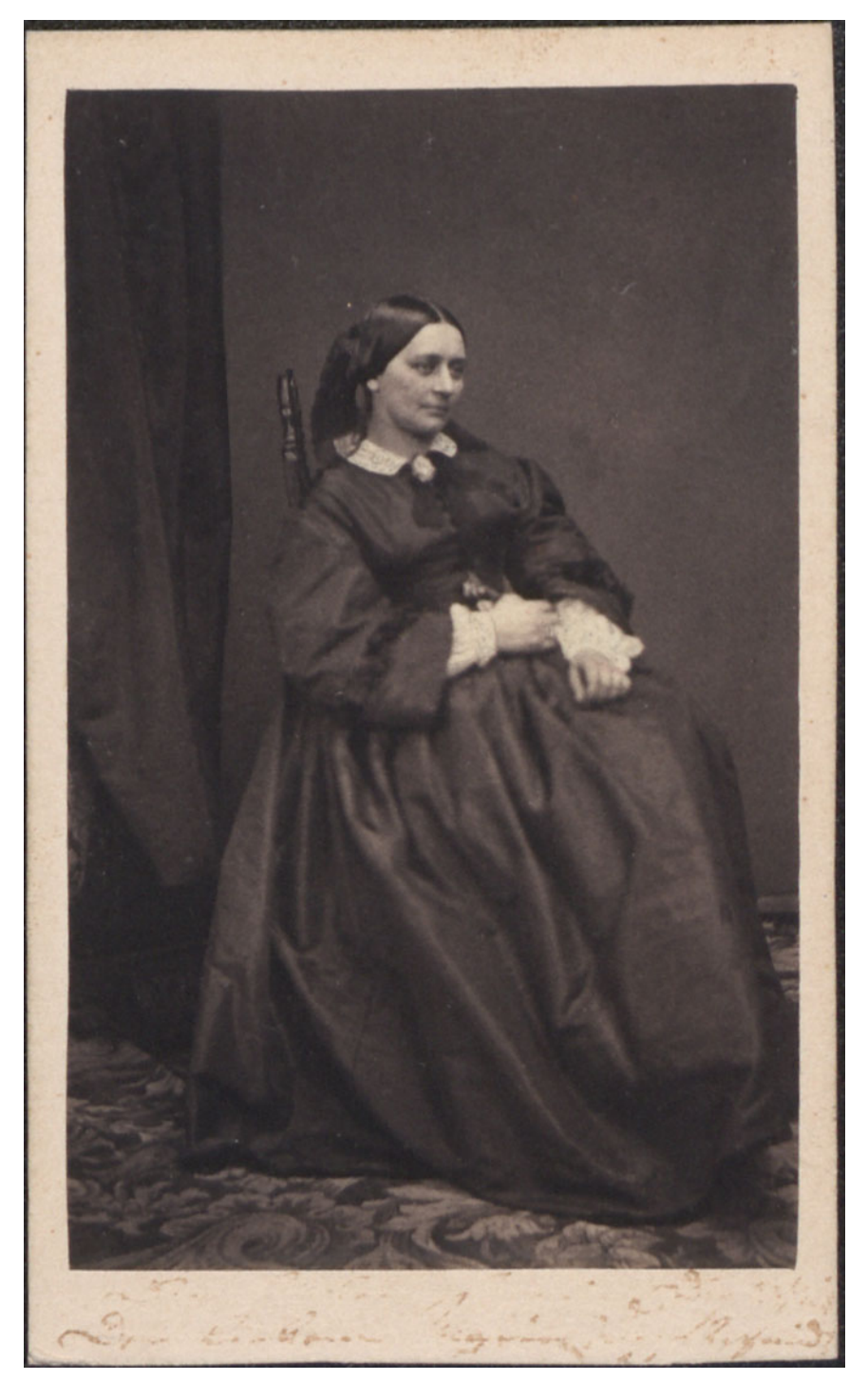
Fig. 8 Carte-de-visite of Clara Schumann taken around 1866 by Bertha Wehnert-Beckmann in Leipzig.