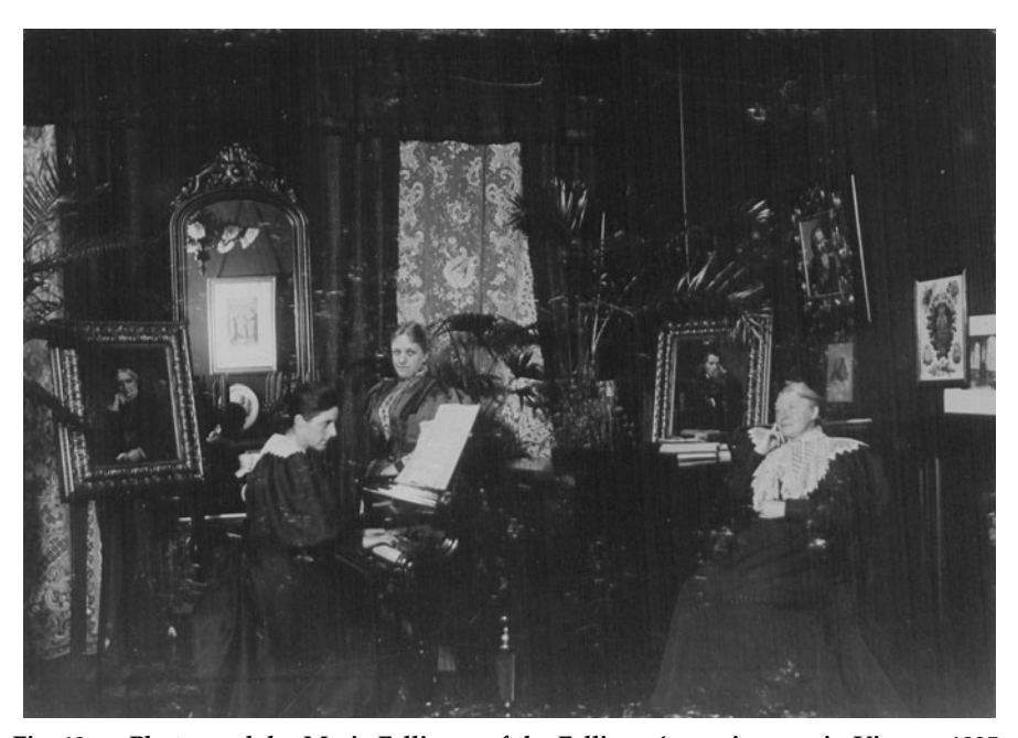
Fig. 13 Photograph by Marie Fellinger of the Fellinger's music room in Vienna, 1895. Courtesy of the Gesellchaft der Musikfreunde in Vienna.