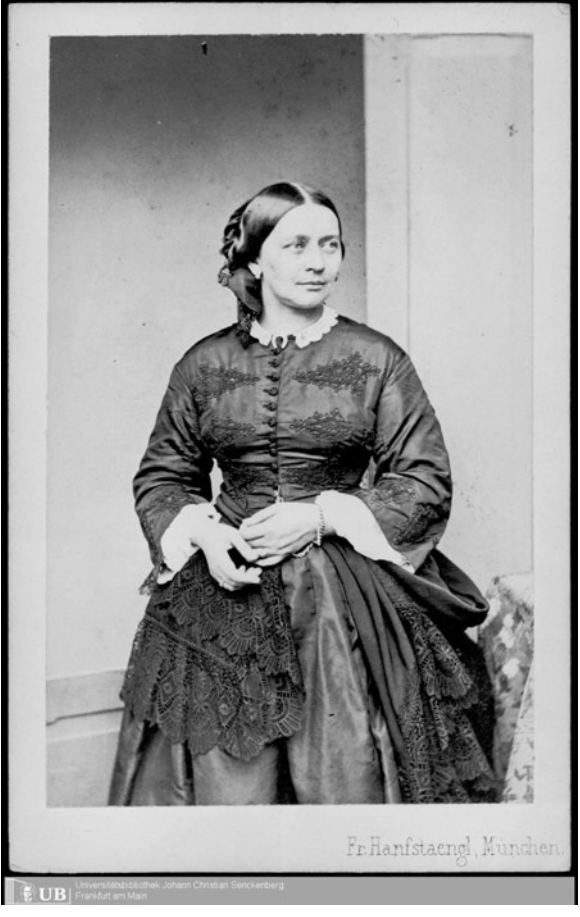
Fig. 5 Carte-de-visite of Clara Schumann taken in 1863 or 1864 by Franz Hanfstaengl in Munich.

Schumann to a machine whose 'technical "rationality" ... remained outside the scope of common knowledge', this frequent prop perhaps further elevates her virtuosity and her publicly displayed femininity 'beyond the scope of ordinary understanding'. In this case, however, I would argue that this symbol simultaneously suggests a liberation from private, domestic activities. This hyper-masculine symbol of technology becomes feminized and commodified. It is intimately affixed to Schumann's body (Figures 2, 4, and 6) and carefully held in her hand (Figure 5). In this way Schumann asserts the ease, frequency and independence with which she moves throughout public spaces; she persistently reminds the viewer of the instability of both her musicality and her gender identity.