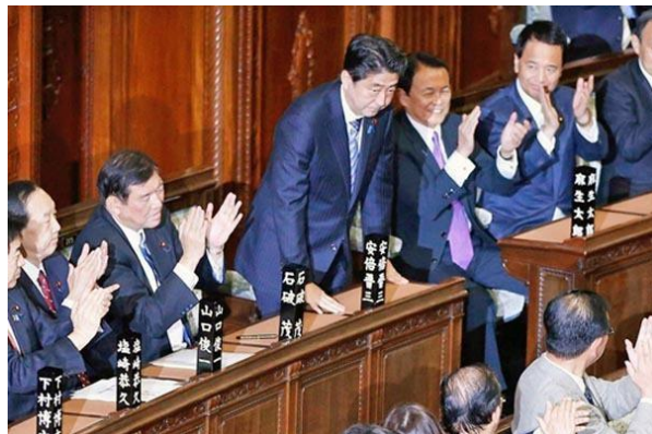
Abe securing prime ministership on 24 December 2014

How did a highly democratic constitution produce the Hitler dictatorship?