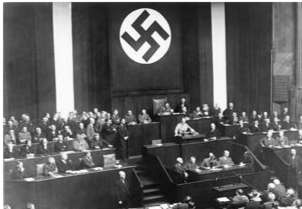
Weimar Constitution booklet Hitler before Reichstag, 1933

A lesson we might learn from the election of both the Hitler and Abe governments is that even minority-elected parties can, once they are in power, implement a political program largely opposed by the population. Hitler's Nazi