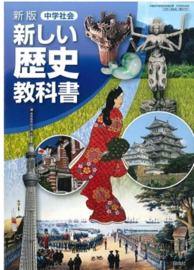
History and Civics textbooks published by the Japan Society for History Textbook Reform

Following this shift to the right in the representations of Japanese history was the simplification of the issues associated with war memory. There have always existed debates about Japan's role in the Asia-Pacific War. But by the 21 st century, the points of contention in these controversies had shifted dramatically from the specific to the symbolic. For example, in the case of the "comfort women" issue, the original debate focused on the number of women involved, what kind of treatment they received, and, most importantly, whether or not the Japanese wartime government was involved in the setting up of the "comfort" stations and recruiting the women. The most heated debate that ensued in the recent years revolves not around issues, but rather, individuals—Japanese nationals who argue that there existed a Japanese state-controlled