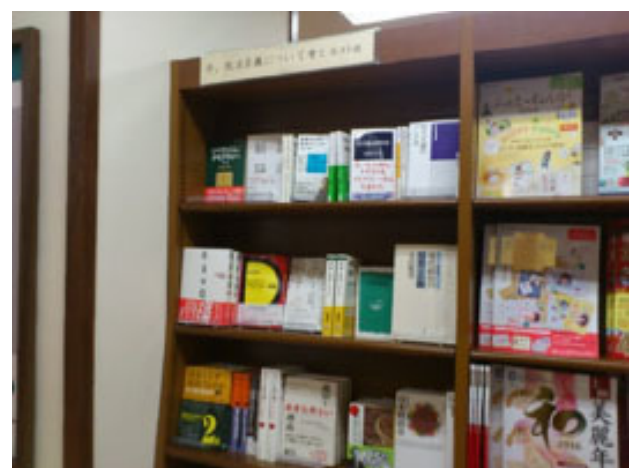
"Fifty Must-Reads for Freedom and Democracy" book fair "Forty-Nine Titles to Think About Democracy Today" book fair