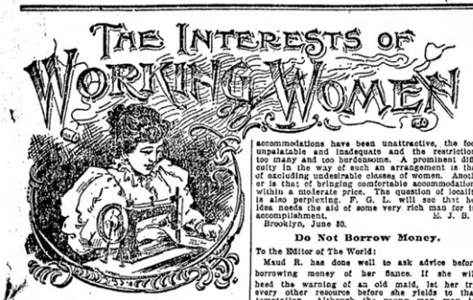
Figure 3. The illustrated headings for "The Interests of Working Women" pictured some of the most common working-class women's occupations: stenographer, shopgirl, and seamstress. New York World , July 5, 1896, 29; June 28, 1896, 31; July 12, 1896, 29.

assured the teacher that she was not alone. 55 The columns could help women readers to recognize common problems and even hash out solutions. One letter to the Ledger complaining of a high February gas bill brought an avalanche of similar stories over the next few weeks. Eventually the column's editor weighed in, calling for oversight and documentation of a system that left the housekeeper no way of knowing if she was being overcharged. 56