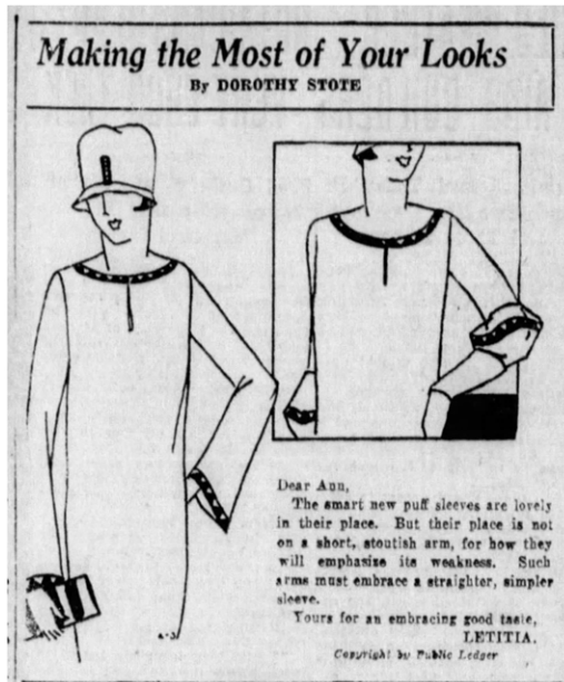
Figure 8. Dorothy Stote's "Making the Most of Your Looks" always pictured slim white women and spoke about their figures as needing to be fixed. Here the article refers to "a short, stoutish arm." Mansfield News (Ohio), Feb. 8, 1927, 11; the feature was syndicated by the Philadelphia Public Ledger .

responses with silverware. The Call sometimes aired readers' pointed or even radical critiques of the status quo, from a woman who recounted going on strike from housework to one who advocated adopting men's dress. Yet the Call belittled these responses when it printed above them "Awarded a silver cheese scoop," or "Awarded a silver jelly spoon," and it seemed to send the winners right back to domestic duties with their prizes. 121 In a 1927 article titled "What Shall We Do With the Woman's Page?" Crystal Eastman called for a more open, collaborative space in the newspaper. "Modern women need a forum, a clearing-house for the exchange of ideas, a meeting-place where they can learn of each other's experiments and benefit by each others conclusions," she wrote. 122 Eastman had no memory of the turn-of-the-century women's columns that had sometimes served these purposes.