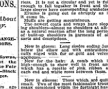
THE LATEST IN DRESSING.

THE LATEST IN DRESSING. Ellen Osborn Talks About Multiple Photography.