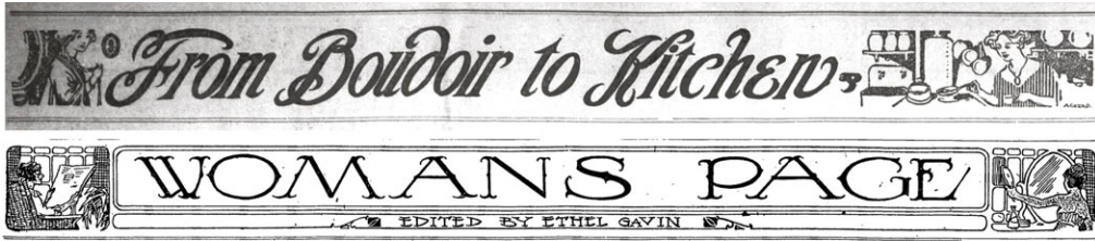
Figure 6. Illustrated headings for the women's page, seemingly indicating women's domain. Referring to and picturing women only within the home might have communicated luxury or constraint, depending on the reader. Buffalo Sunday Morning News , Mar. 23, 1913, 28; Chicago Defender , Apr. 23, 1921, 5.

Some readers asked for and appreciated the optimism, fantasy, and escape of the women's page. Answering the New York Herald's 1891 survey of what women wanted in their newspapers, one reader responded "write us long columns of happiness." 112 A 1901 reader praised the Atlanta Constitution's women's page for casting "sunbeams across the home keeper's dusty, every day road." 113 In a 1904 etching, the artist John Sloan depicted the escapist pleasure to be had from the women's page (Figure 7). A woman in a tenement momentarily ignores or forgets her surroundings—the unfinished washing in the basin, the cat that is clawing the comforter. Instead she peruses the newspaper's "Page for Women."