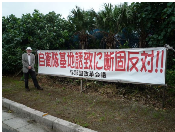
Anti-base poster, Yonaguni, November 2011

East Asia’s territorial issues, notably centred now on the Senkaku/Diaoyu Islands, will either be solved, as part of a comprehensive settlement and the construction of a regional order of peace and cooperation in the interests of the surrounding states and peoples, or they will fester and feed heightened confrontation and militarization. It is hard to see evidence of the former at present. As for the latter, it will mean places like Yonaguni becoming more vulnerable and divided.