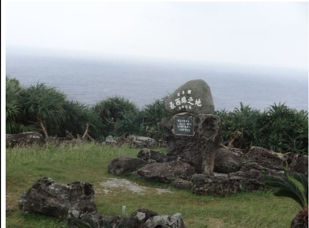
Cape Irizaki, Yonaguni, Westernmost Point in Japan (Photograph: Shiba Hiromoto, November 2011)

It goes without saying that Tokyo holds Yonaguni (and the other Yaeyama islands) to be unquestionable, integral Japanese territory. And yet its status has been much more ambiguous than such a term might suggest.