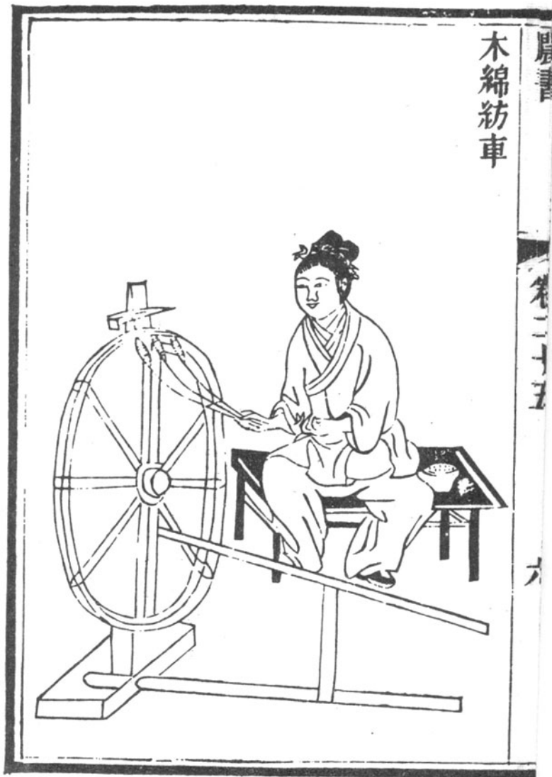
Figure 3. Spinning wheel for cotton. Wang Zhen's Nongshu (Agricultural Treatise), 1783 Palace edition, Chapter 25, 6a.

In the case of the cotton-processing implements, the gin, bow, spinning wheel and multi-bobbin reels which Wang Zhen describes for the first time in his 'Illustrated register' (Figure 3), his accounts seem to have passed muster even with the exigent Xu, who adds only a few notes explaining minor changes in structure or operation. 63 Here Wang's hope for diffusion was realized: these implements were gradually adopted